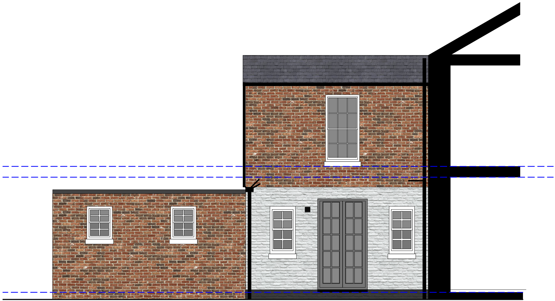
3 Existing West Elevation Scale: 1:50