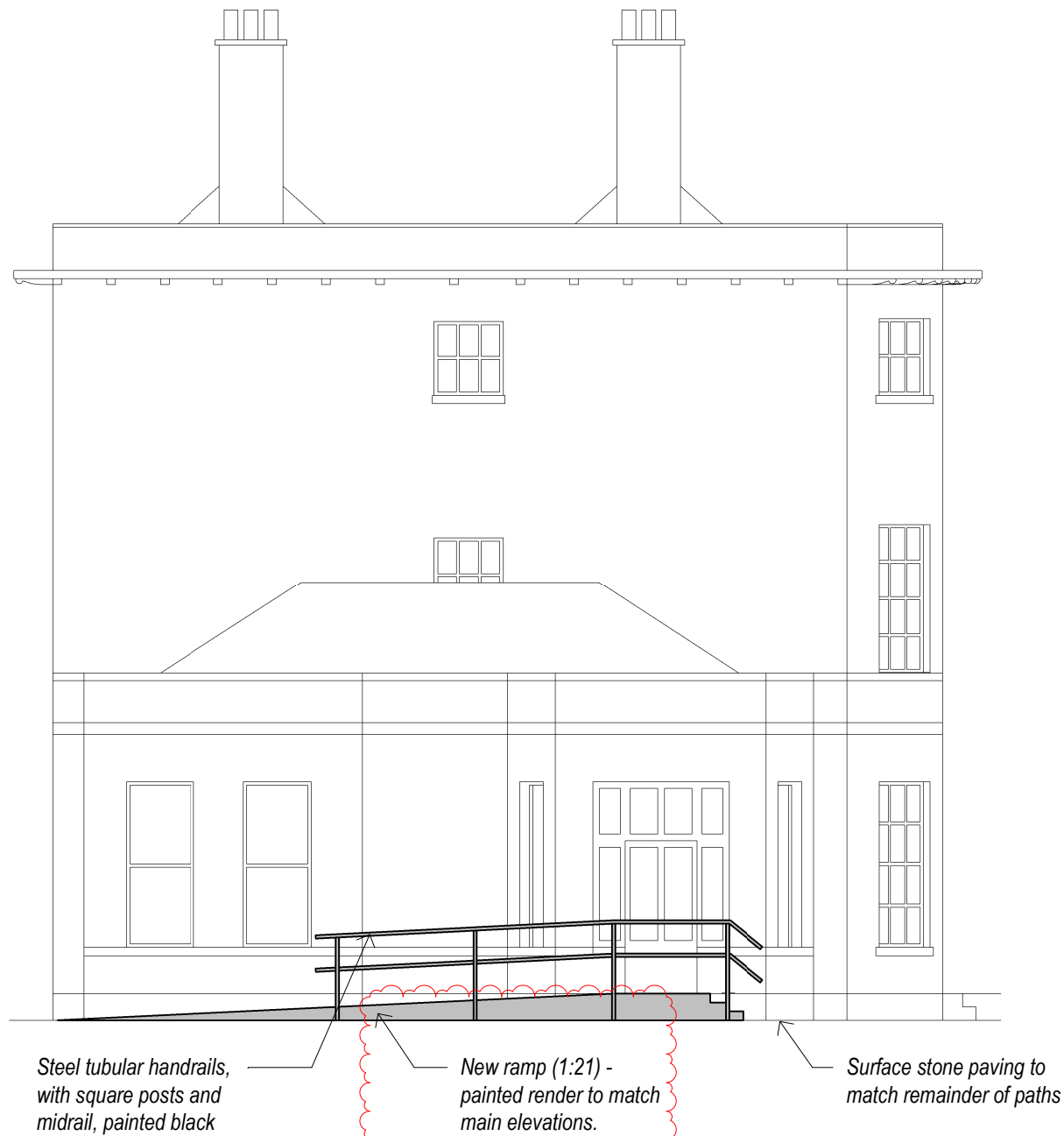
1 Elevation North-East 1 : 100