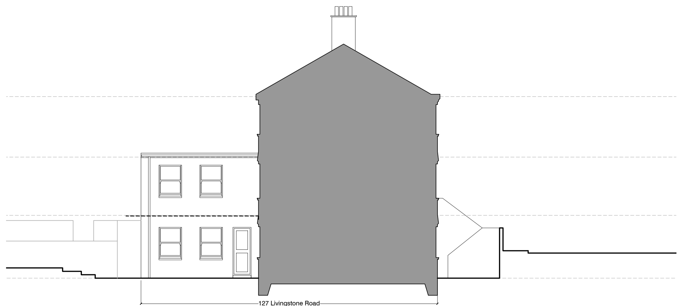
08 West Elevation & Section Scale:1:100