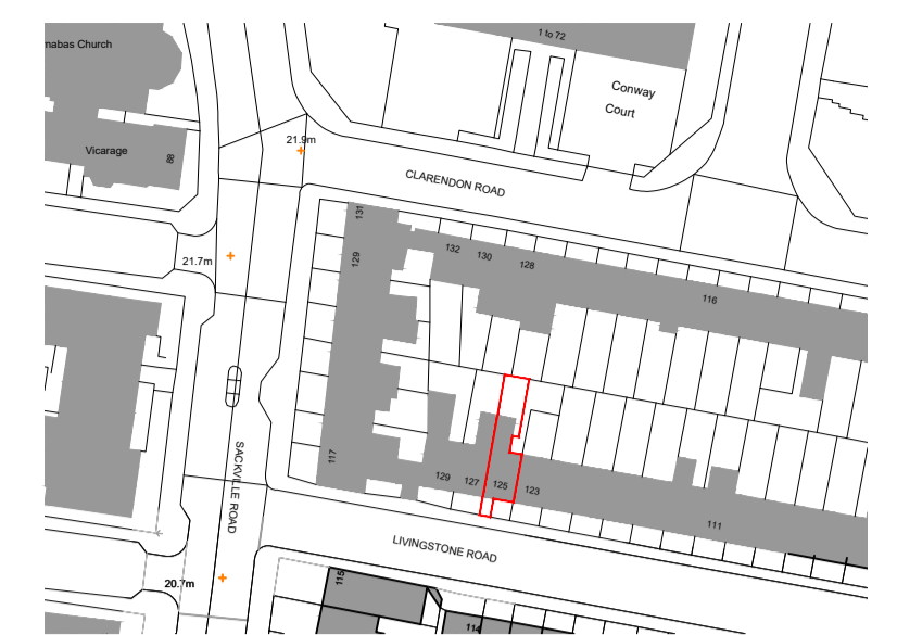
06 Location Plan Scale:1:1250