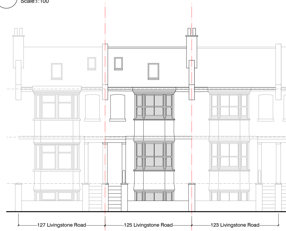
10 South Elevation Scale:1:100