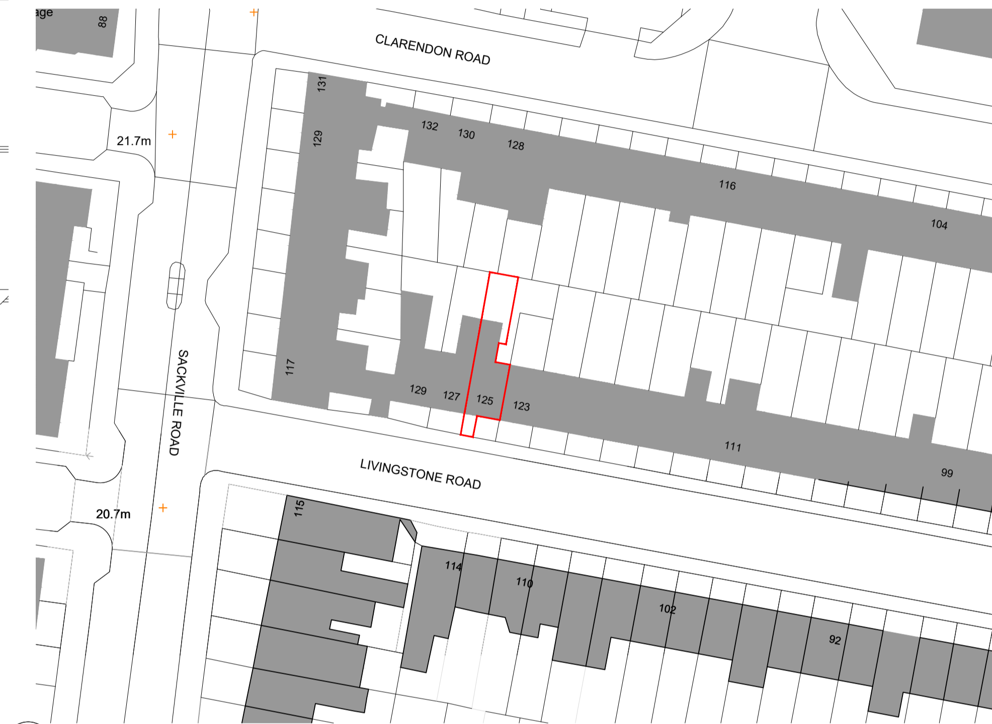
05 Block Plan Scale:1:500