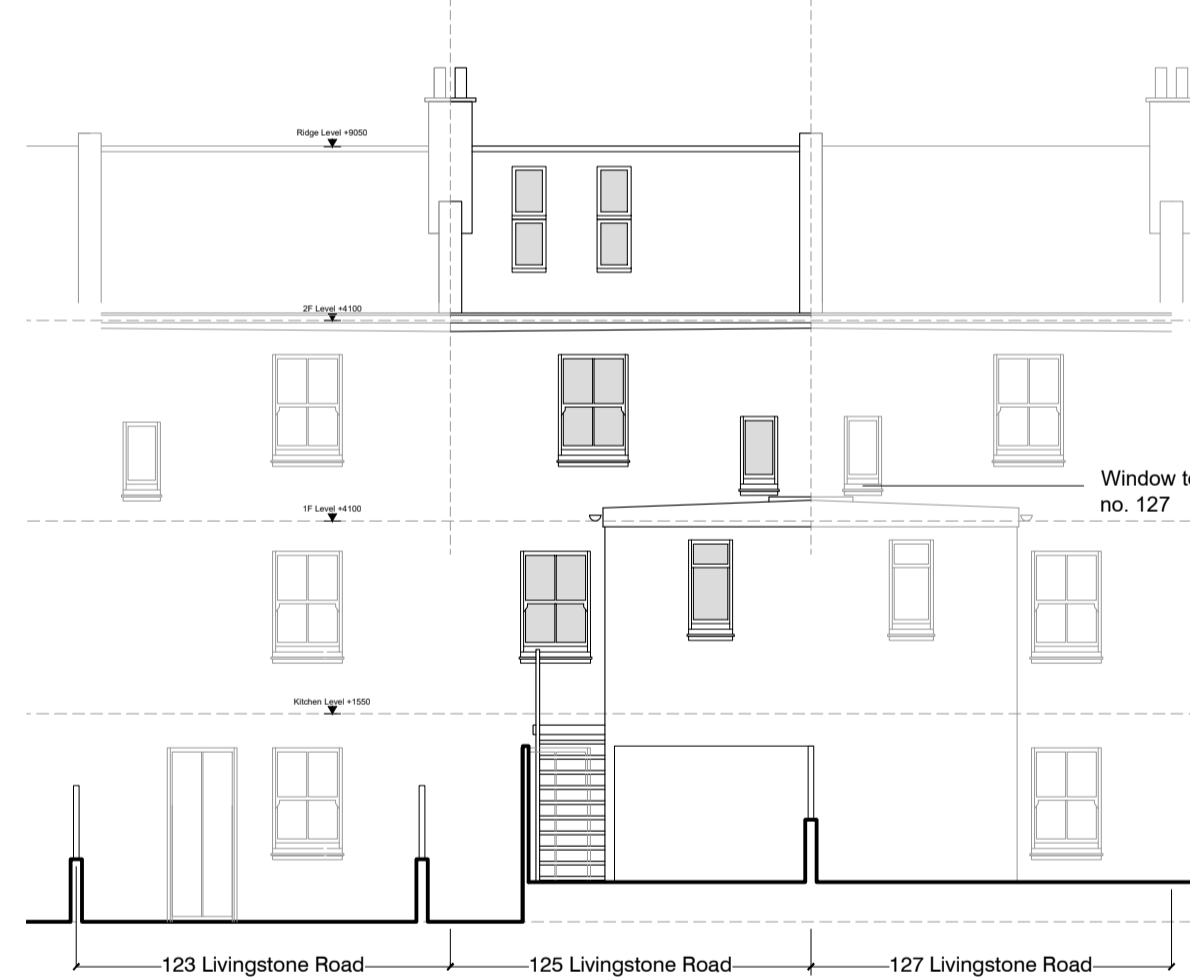
09 North Elevation Scale:1:100