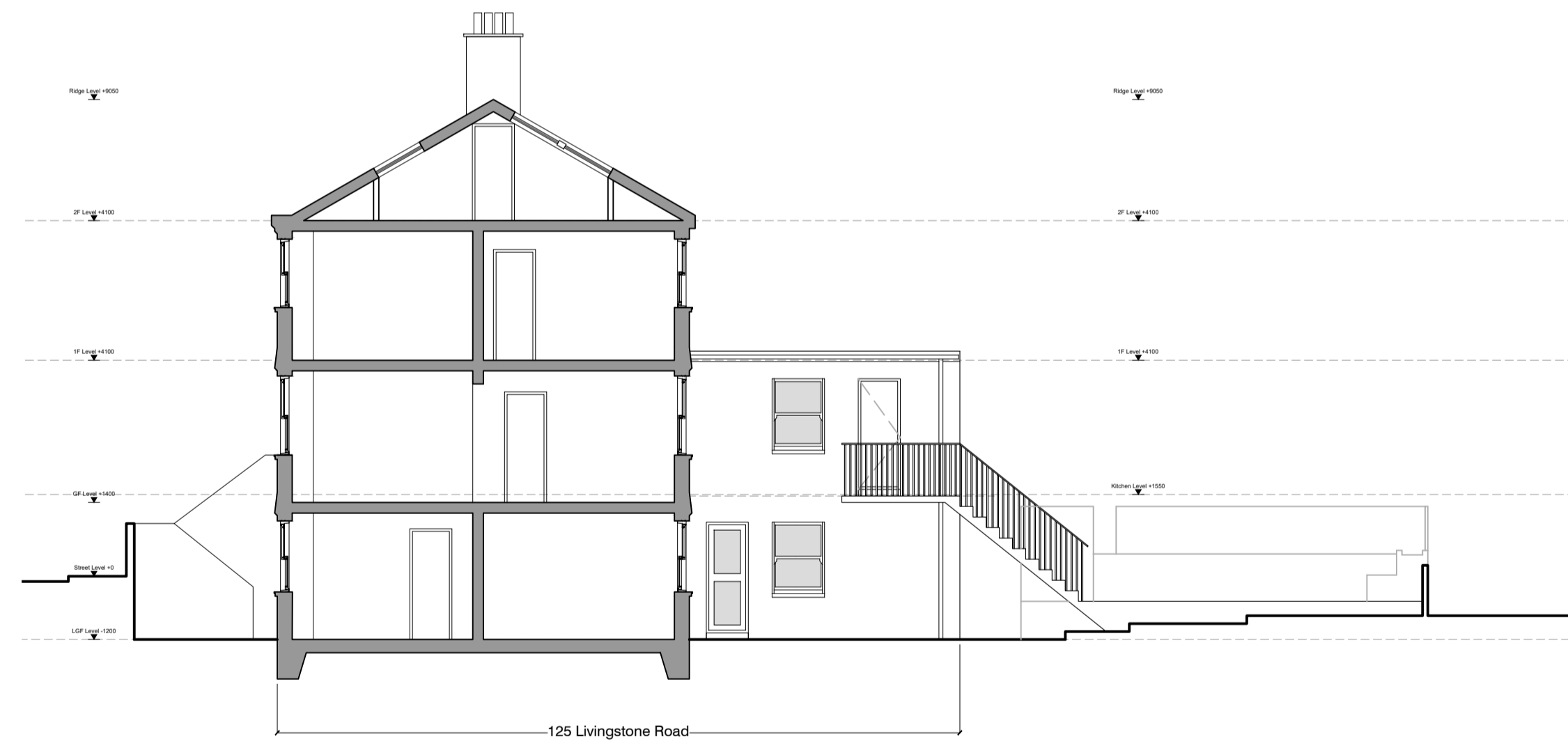
07 East Elevation & Section Scale:1:100