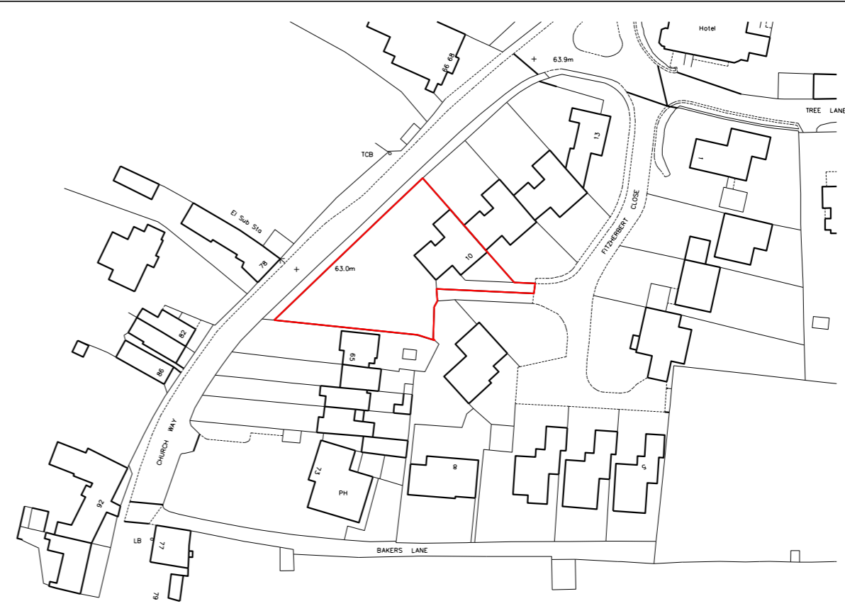
02 - Location Plan Scale 1:1250 @ A3