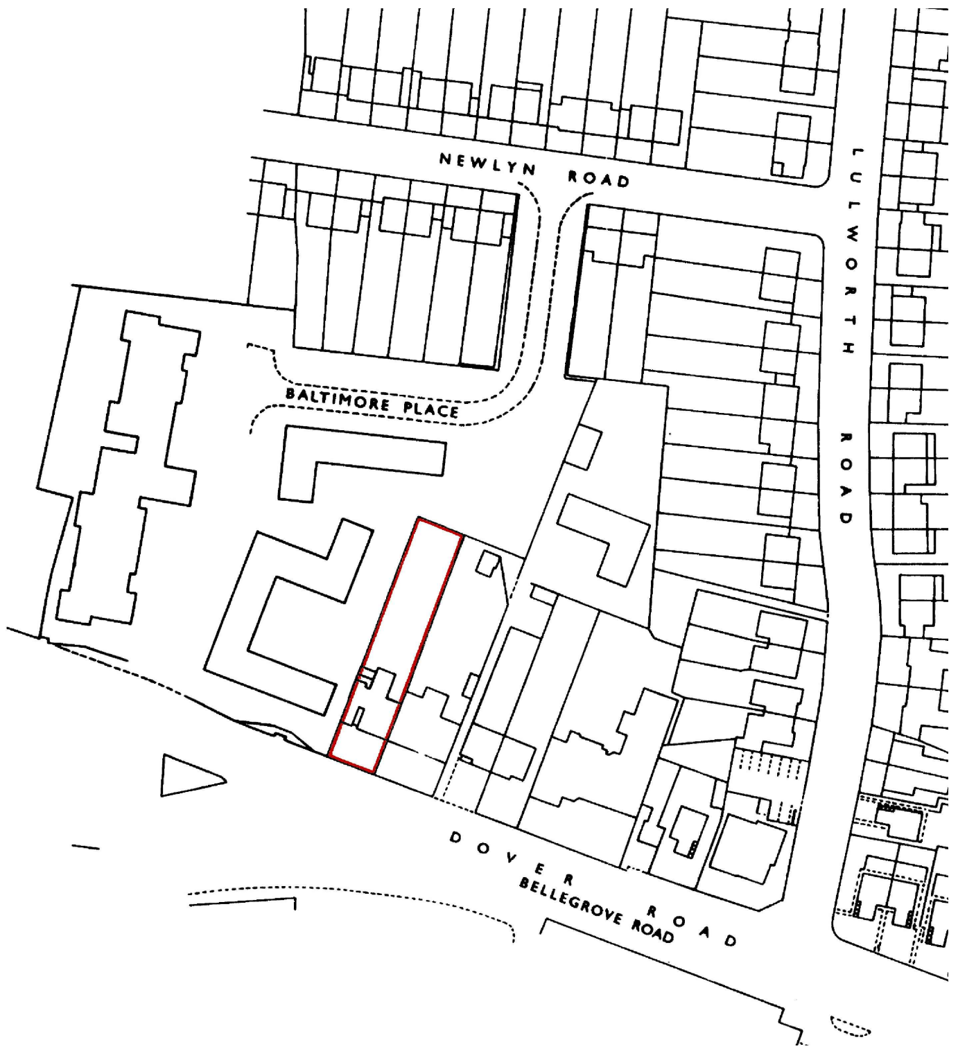
site plan – scale 1:1250