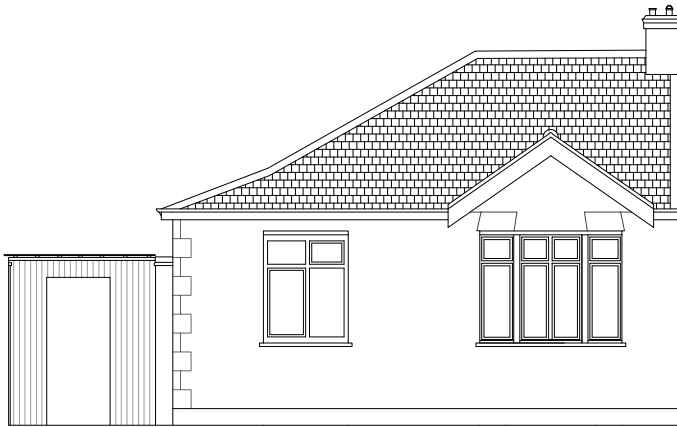
Existing Front Elevation Scale - 1 / 100