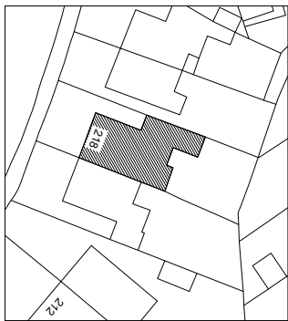
Existing Block Plan Scale - 1 / 1000