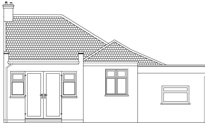
Existing Rear Elevation Scale - 1 / 100