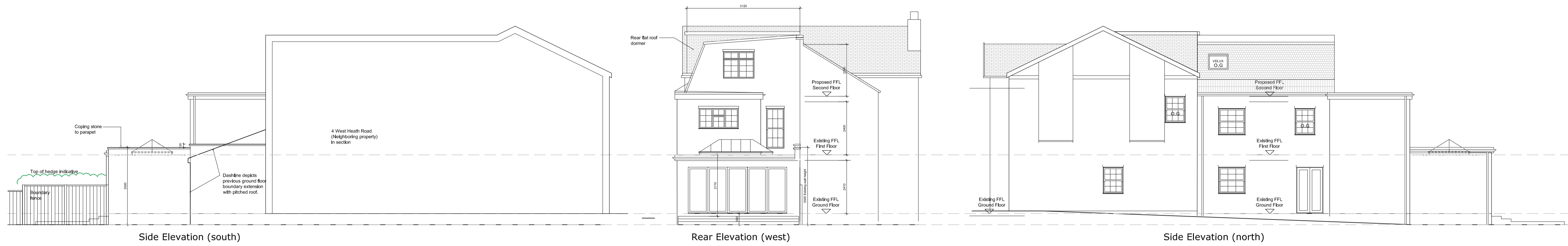
AS EXISTING ELEVATION DRAWINGS: UNLAWFUL SITUATION