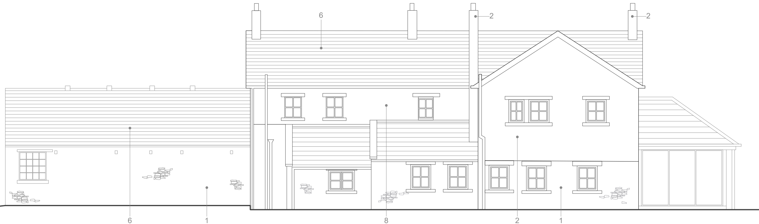
1 Existing North Elevation Scale: 1:100