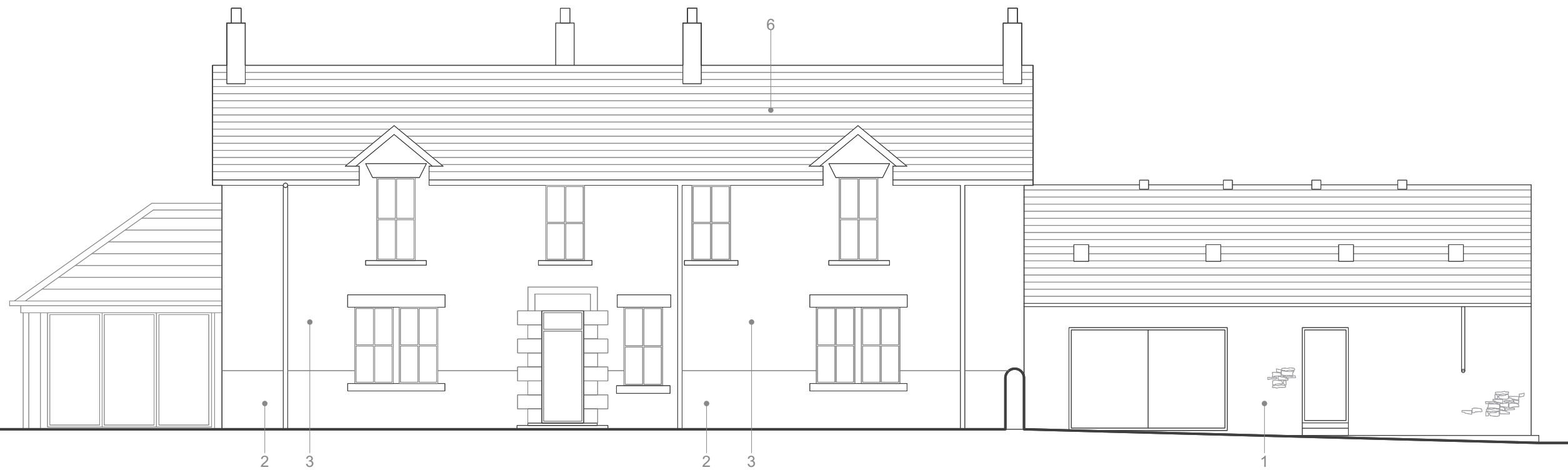
1 Existing South Elevation Scale: 1:100