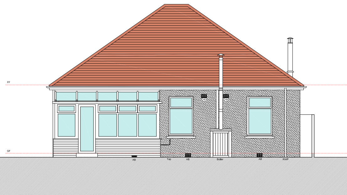
3 South East Elevation 1:100 @ A3