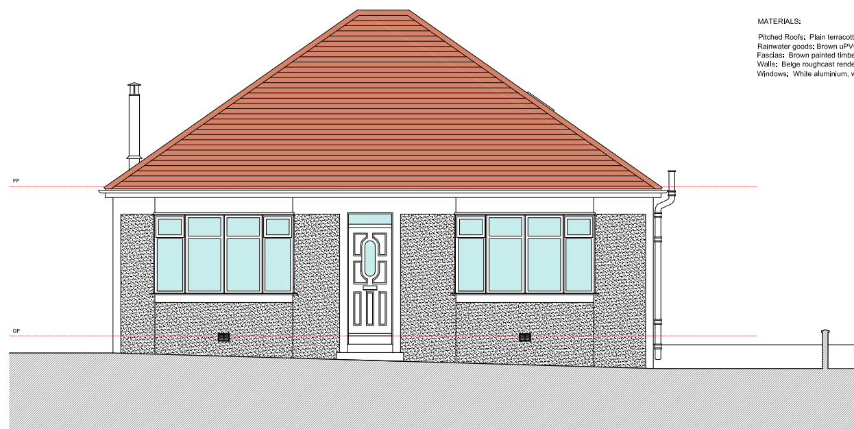
1 North West Elevation 1:100 @ A3

MATERIALS: Pitched Roofs: Plain terracotta roof tiles Rainwater goods: Brown uPVC gutters, cast iron downpipes Fascias: Brown painted timber, wood effect uPVC to Conservatory Walls: Belge roughcast render with white banding, facing brick to Conservatory Windows: White aluminium, wood effect uPVC to Conservatory