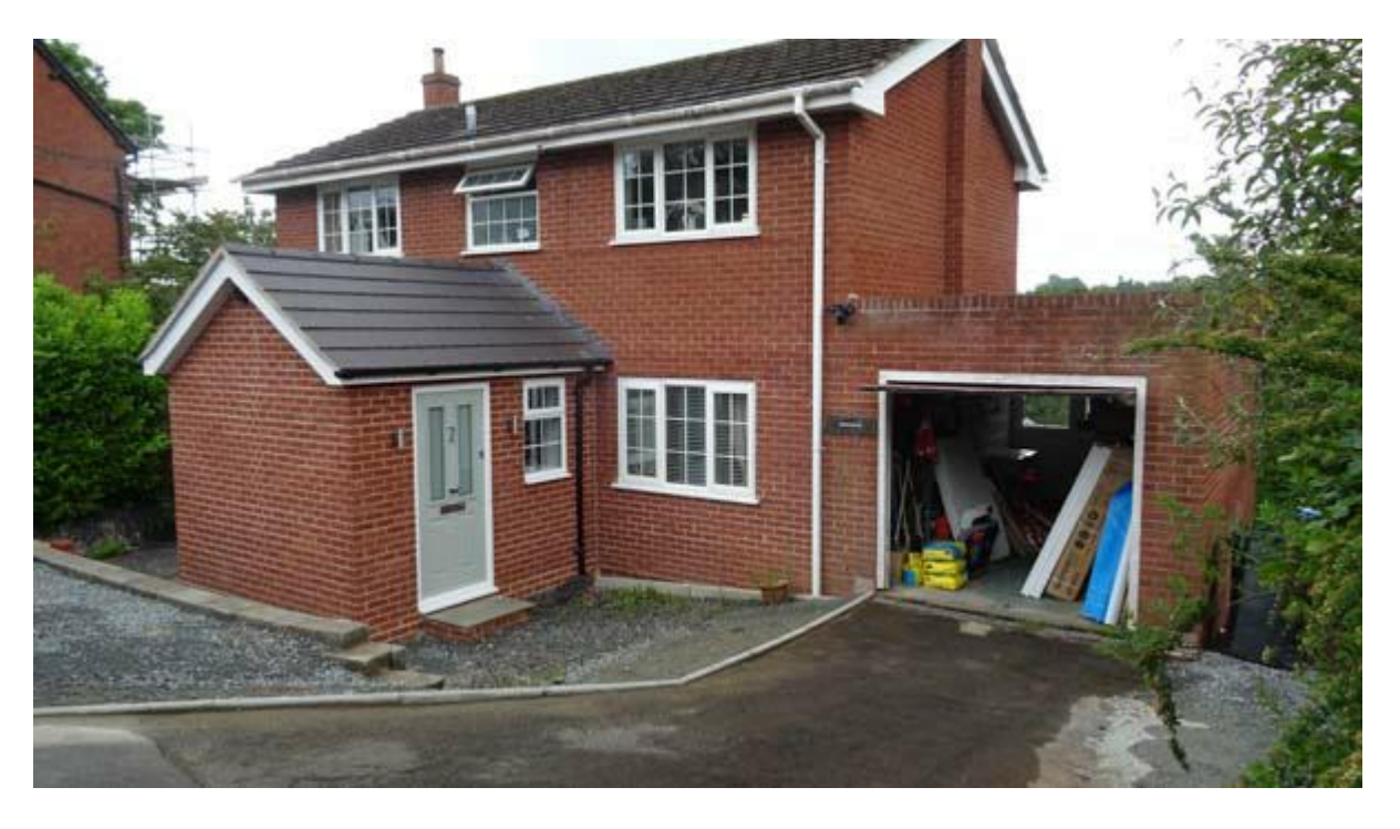
NORTH ELEVATION WITH LARGER PROPERTY TO THE EAST

NORTH ELEVATION (FRONT) OF HOUSE — looking from Boraston Lane The exiting garage is to be demolished as it has poor foundation and replaced with a wider construction with a first floor bedroom over, matching the main details of the house, but adding a low dormer roof with feature boarding to the small windows from new bathroom and dressing area.