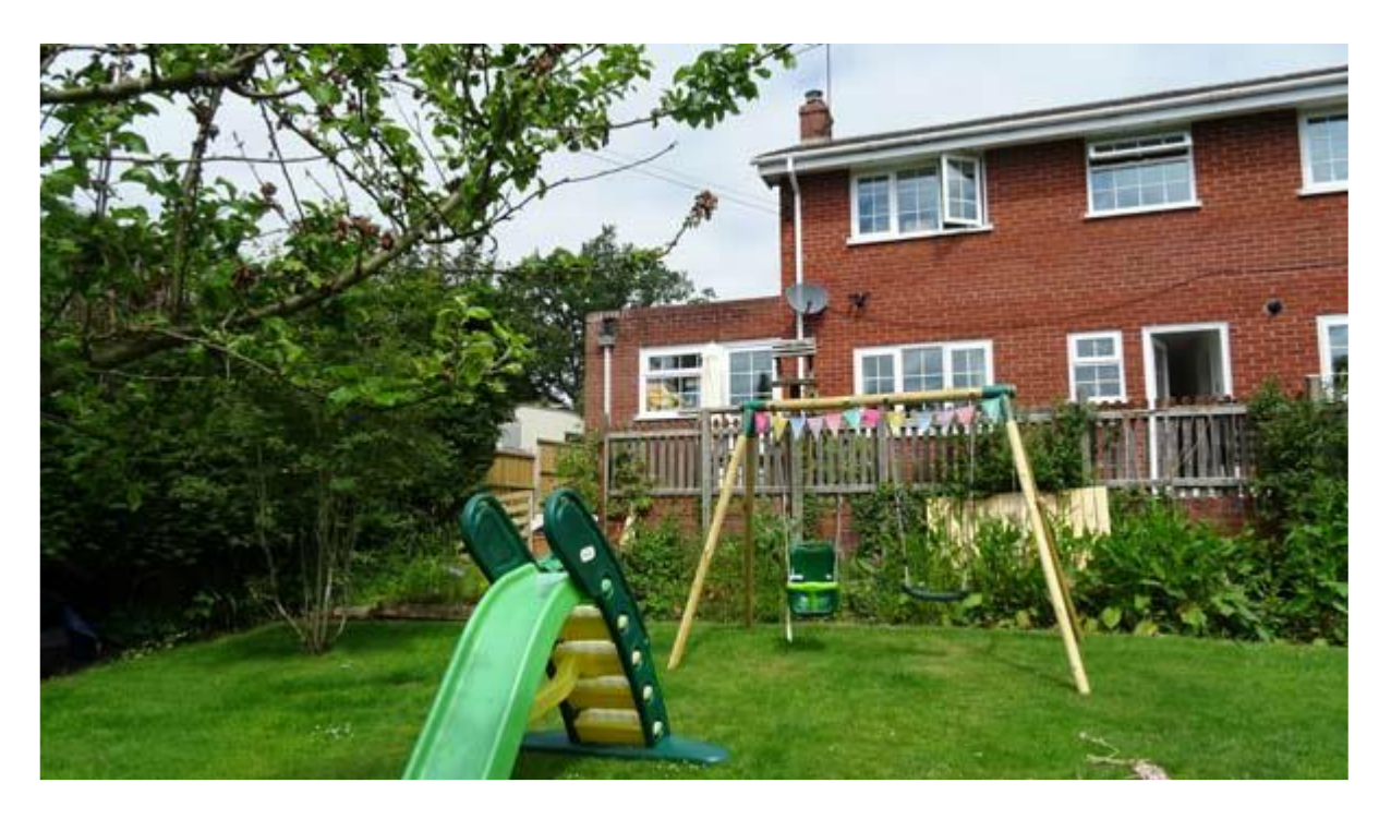
SOUTH GARDEN – Looking towards the garage and the site of the two storey extension proposed. The single storey extension will extend to the cover the terrace with the new rear wall built in front of the existing terrace masonry retaining wall.