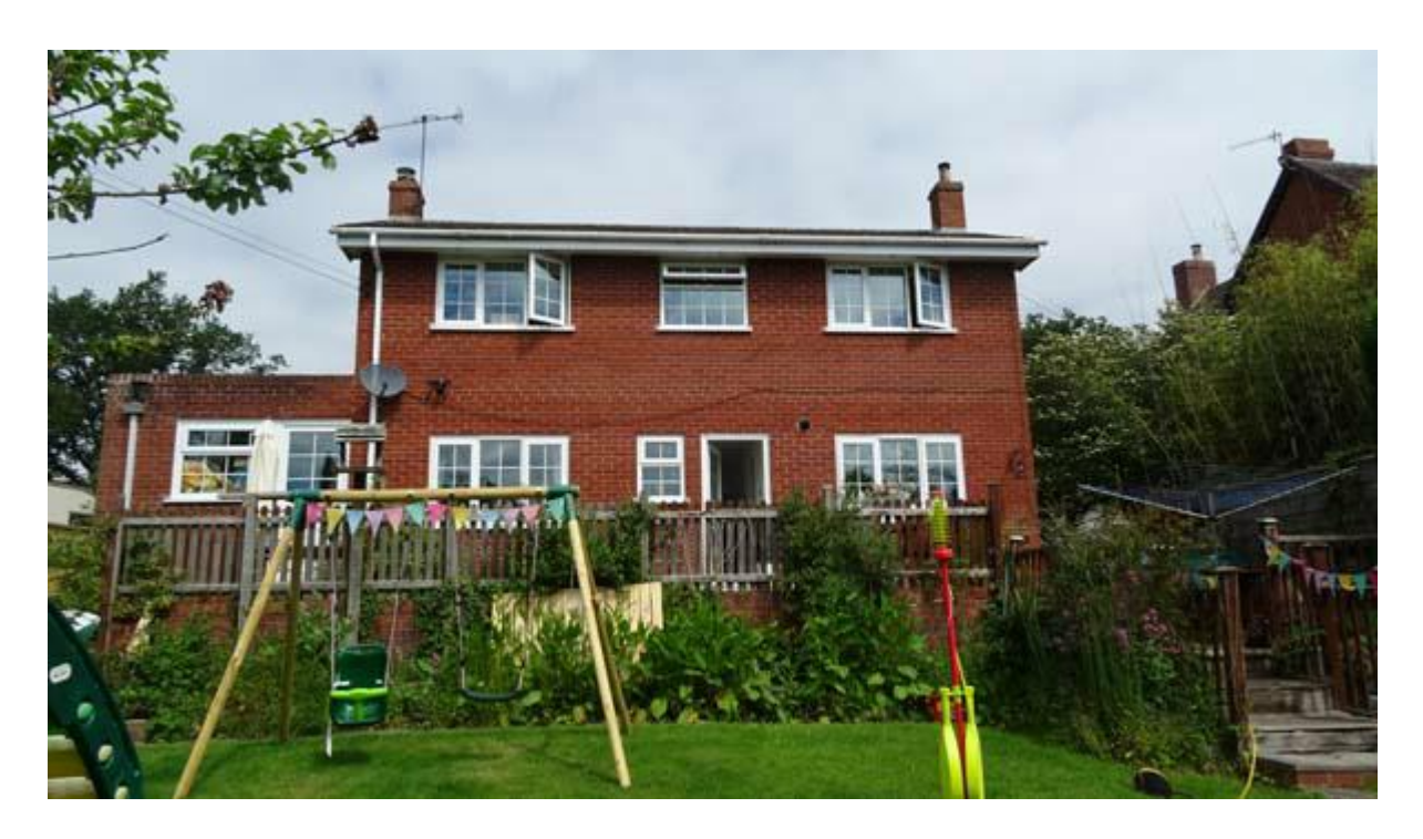
SOUTH ELEVATION (REAR) OF HOUSE – Garden slopes away from the terrace that sits approximately 1000 mm above the lawn.