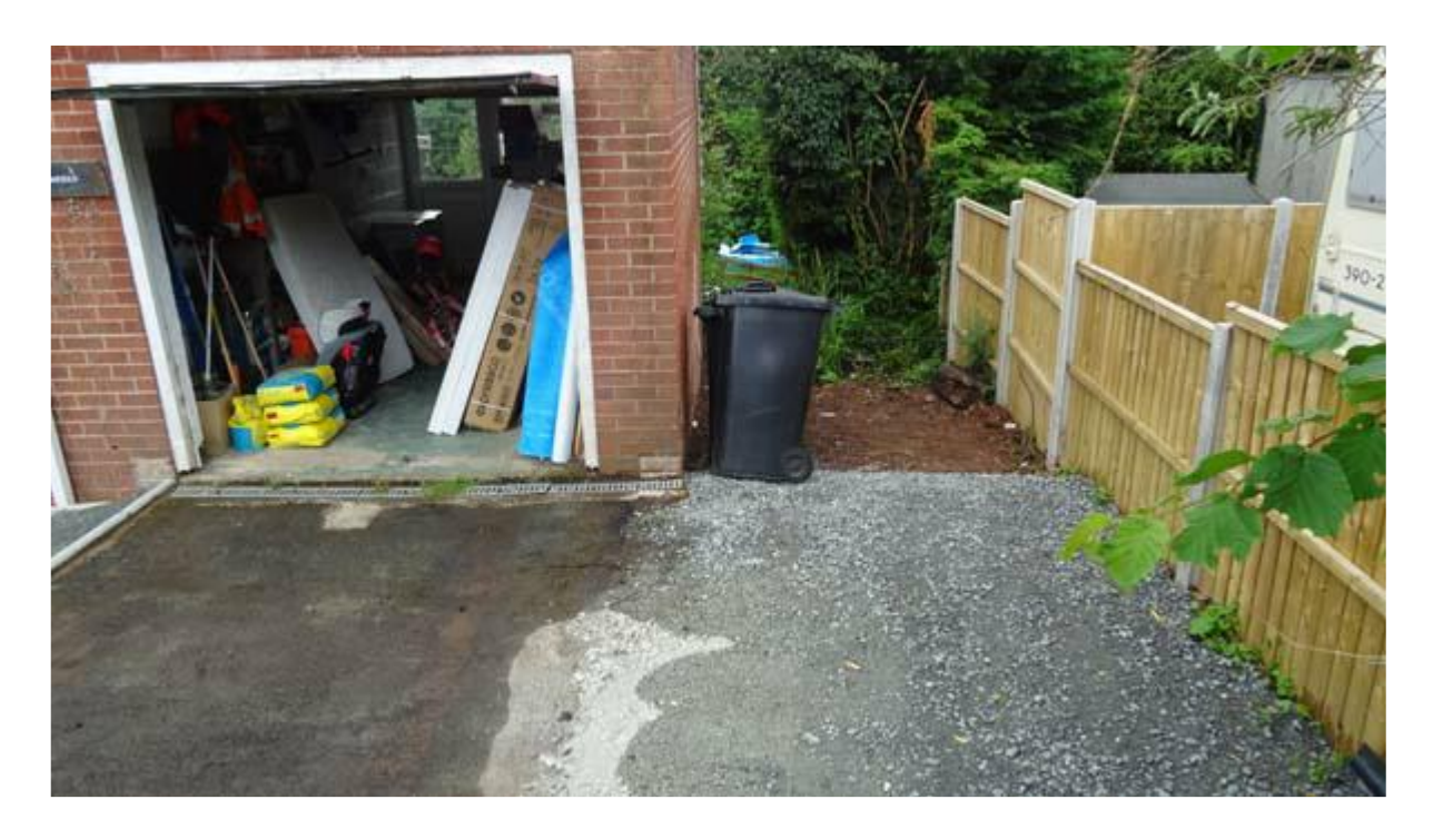
DETAIL OF THE SIDE SPACE TO THE WEST BOUNDARY – New garage increase in width to the refuse bin leaving 1300mm gap for a side gate between the new masonry and the fence panelling. The adjacent property is set away form the boundary with existing side driveway and parking area.