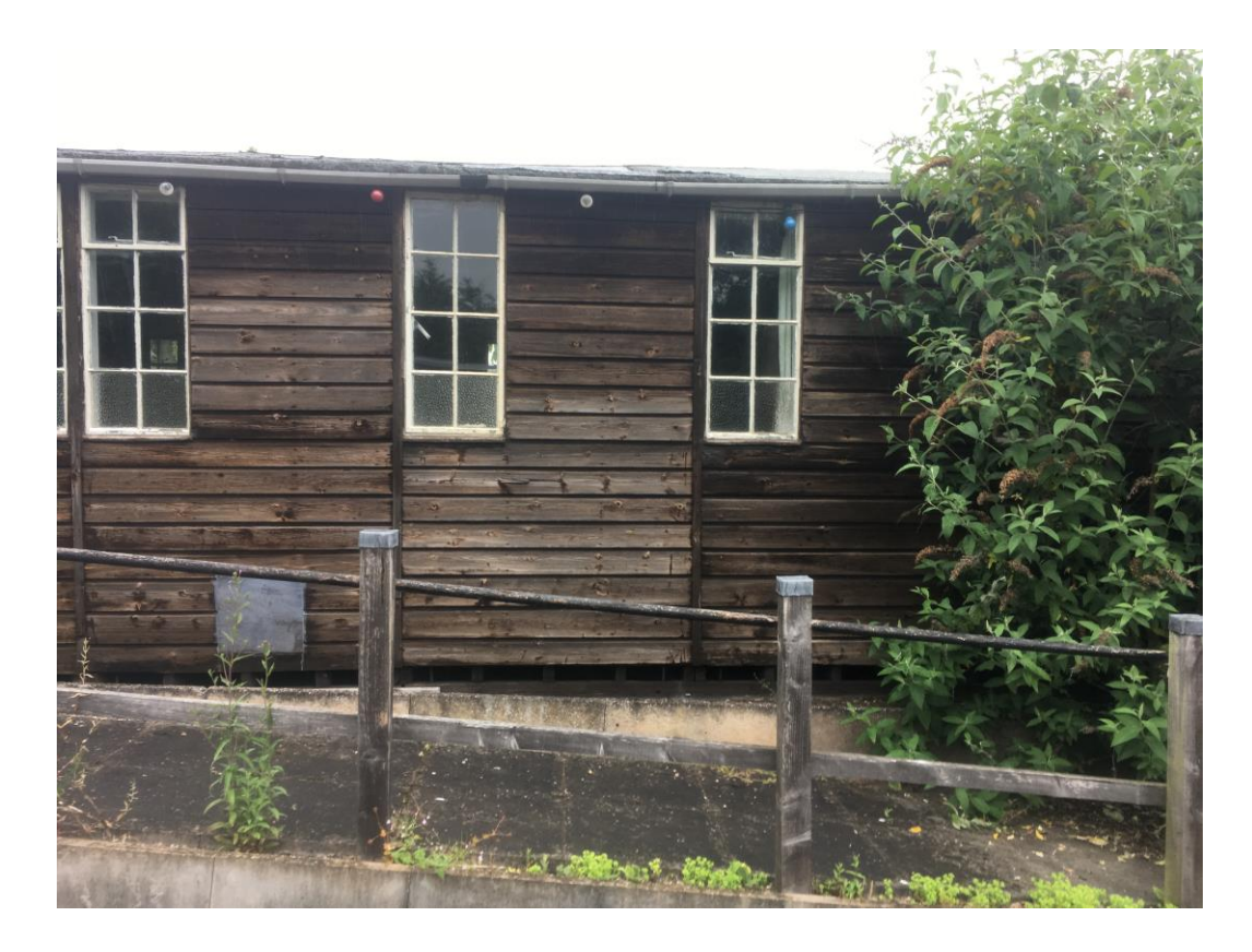
Side facing the ramp