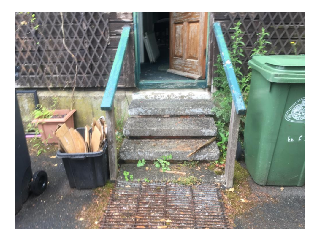
Steps to remain, handrails removed