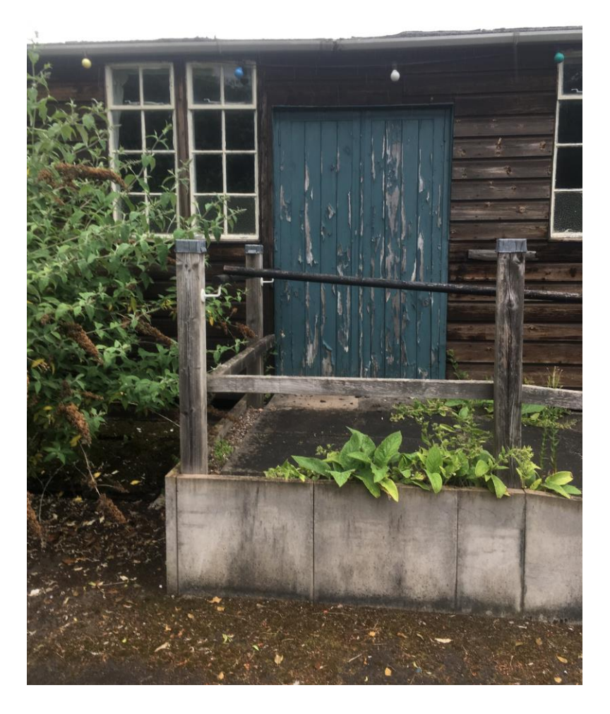
View of ramp to be retained