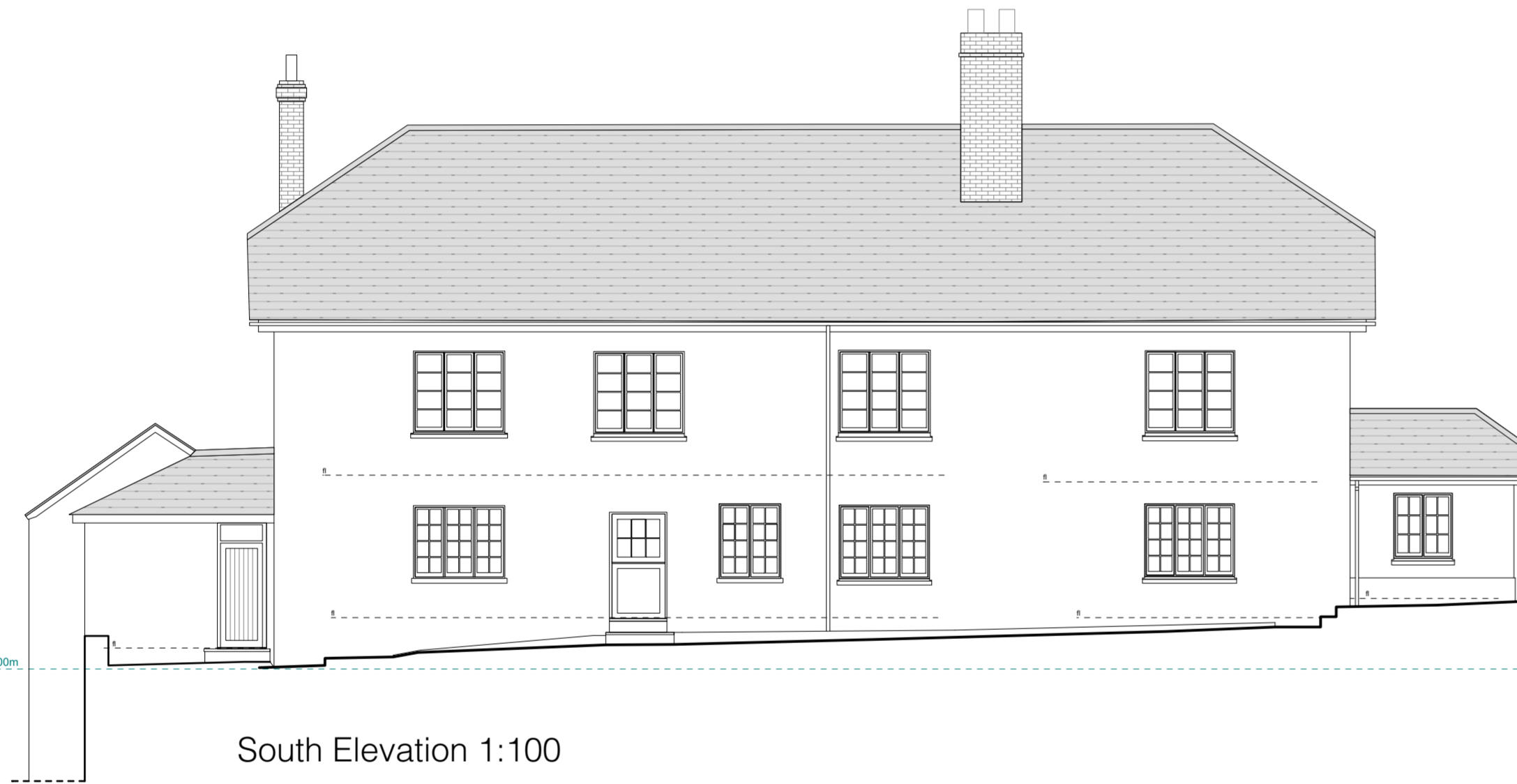
South Elevation 1:100