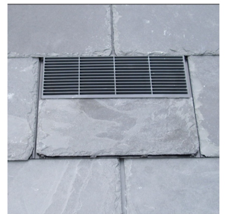
Example slate tile extract vent