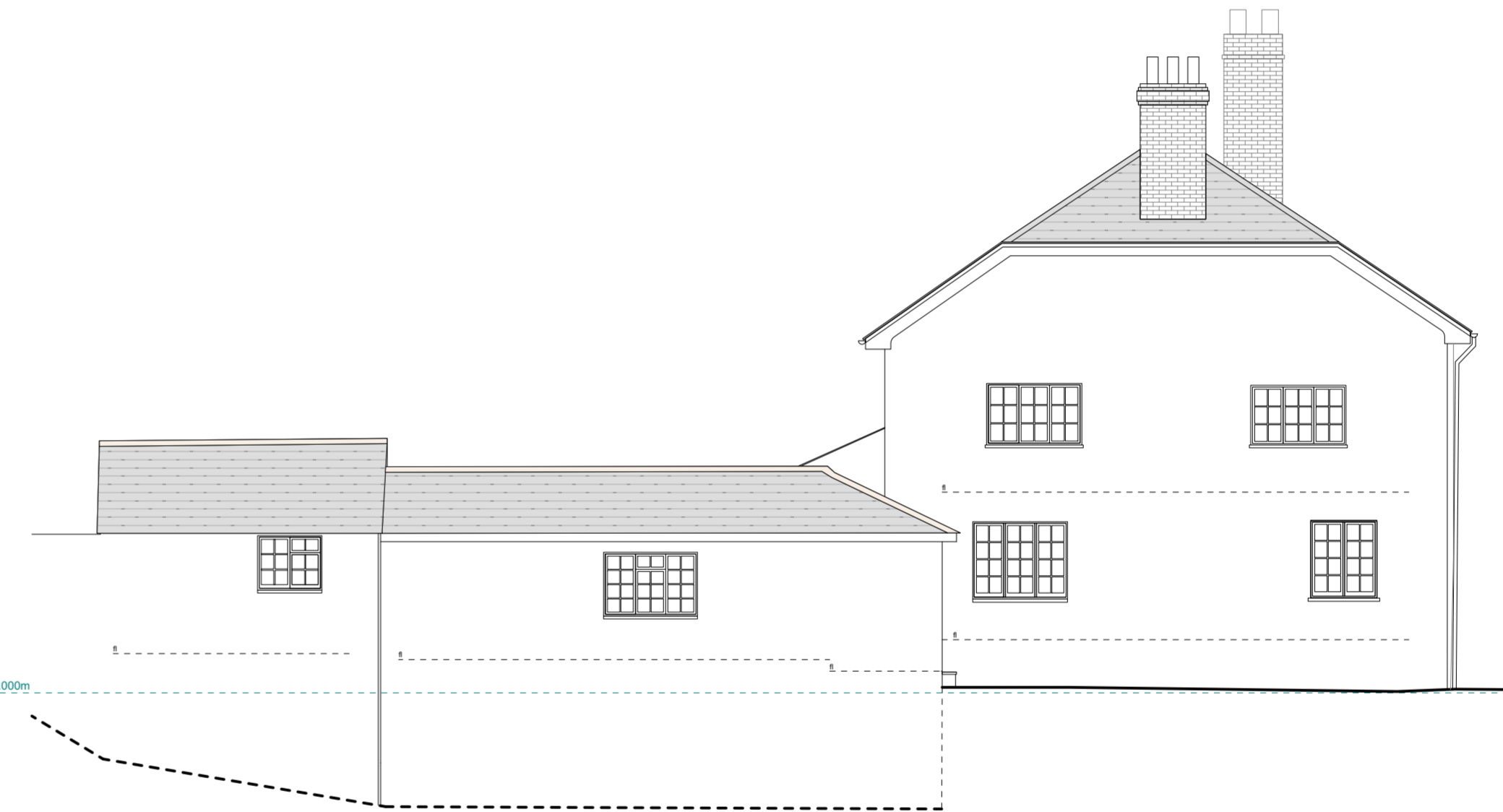
West Elevation 1:100