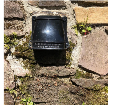
Example wall extract vent