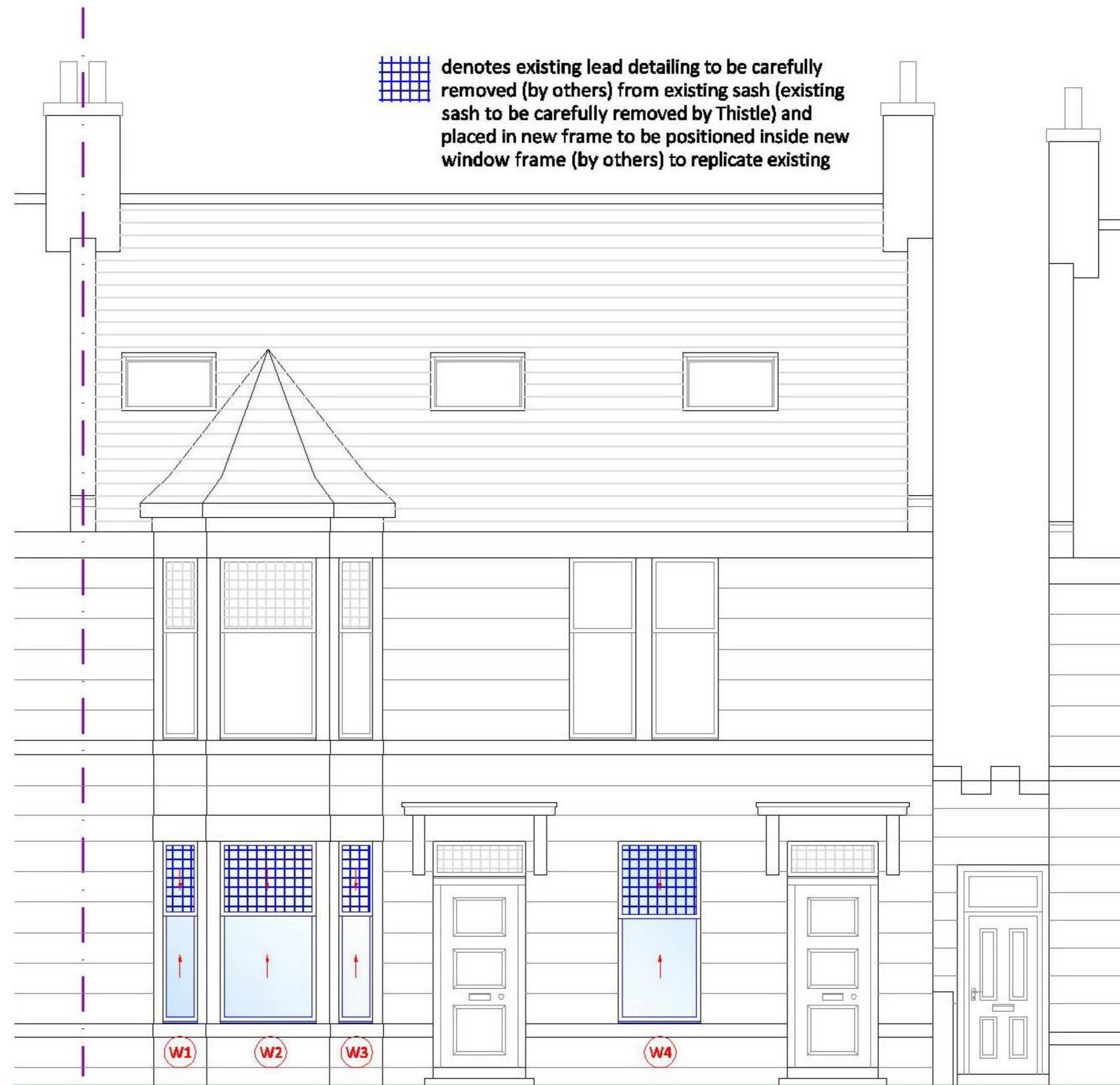
Proposed South East Elevation (1:100)