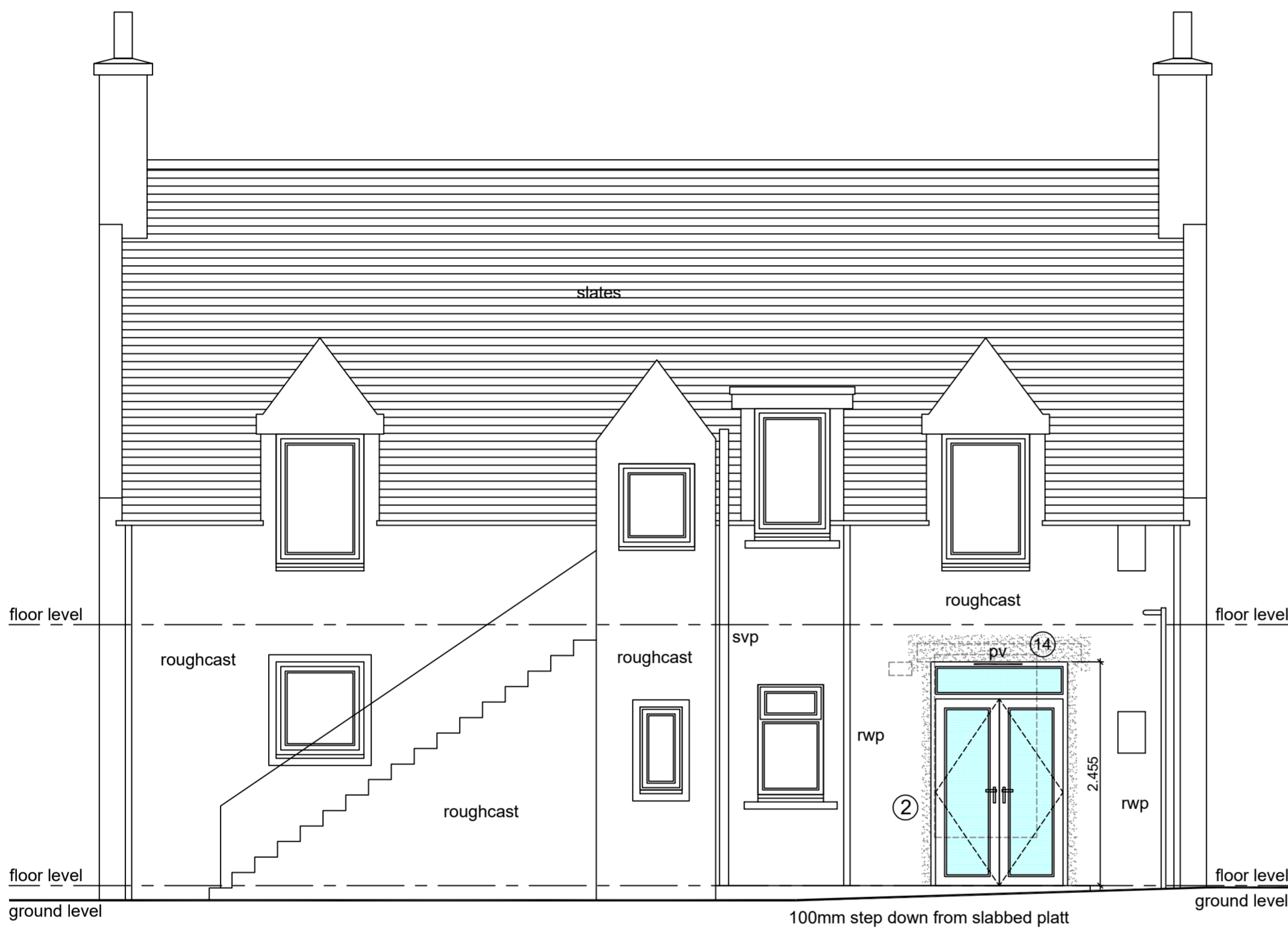
PROPOSED REAR (EAST) ELEVATION. 1:50.