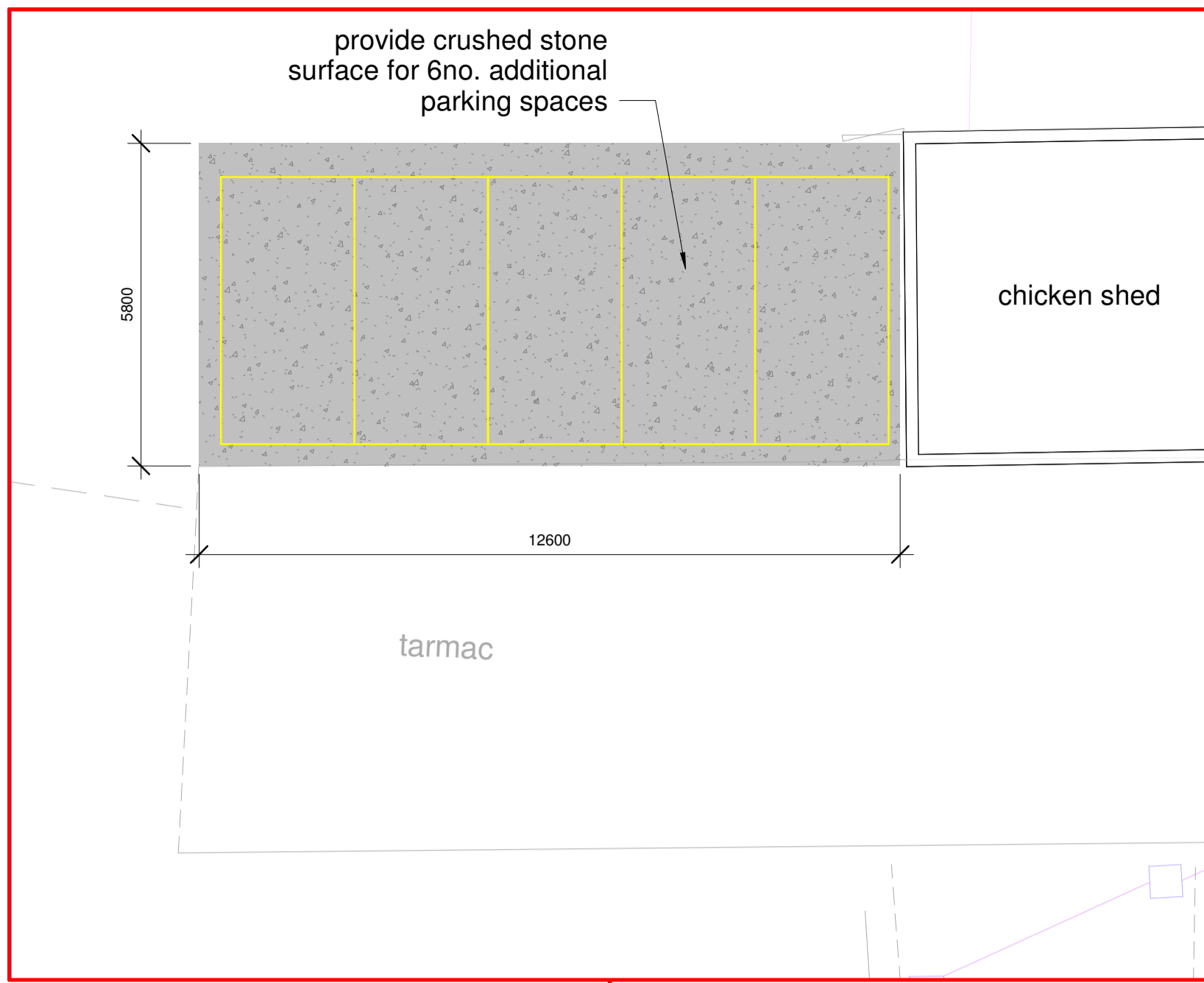
Parking adj. chicken shed 1 : 100