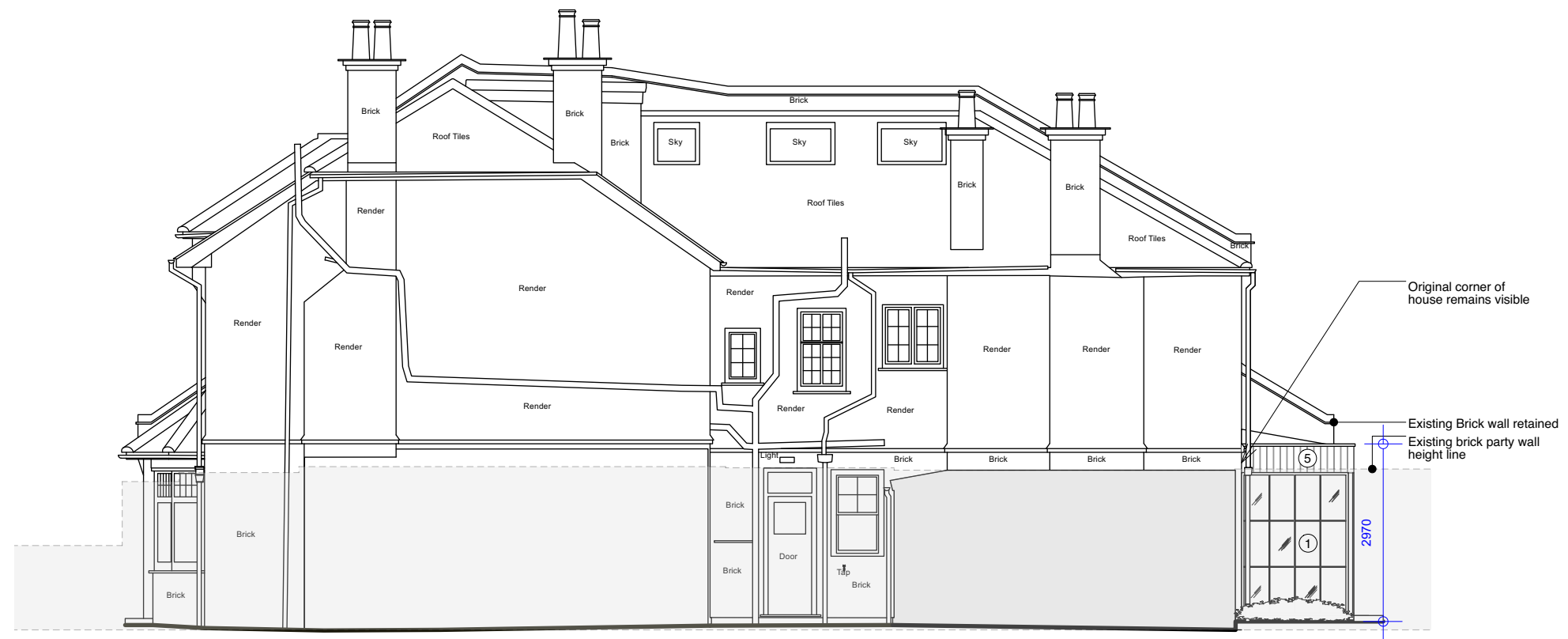
3 Proposed Elevation - Side Scale: 1:100