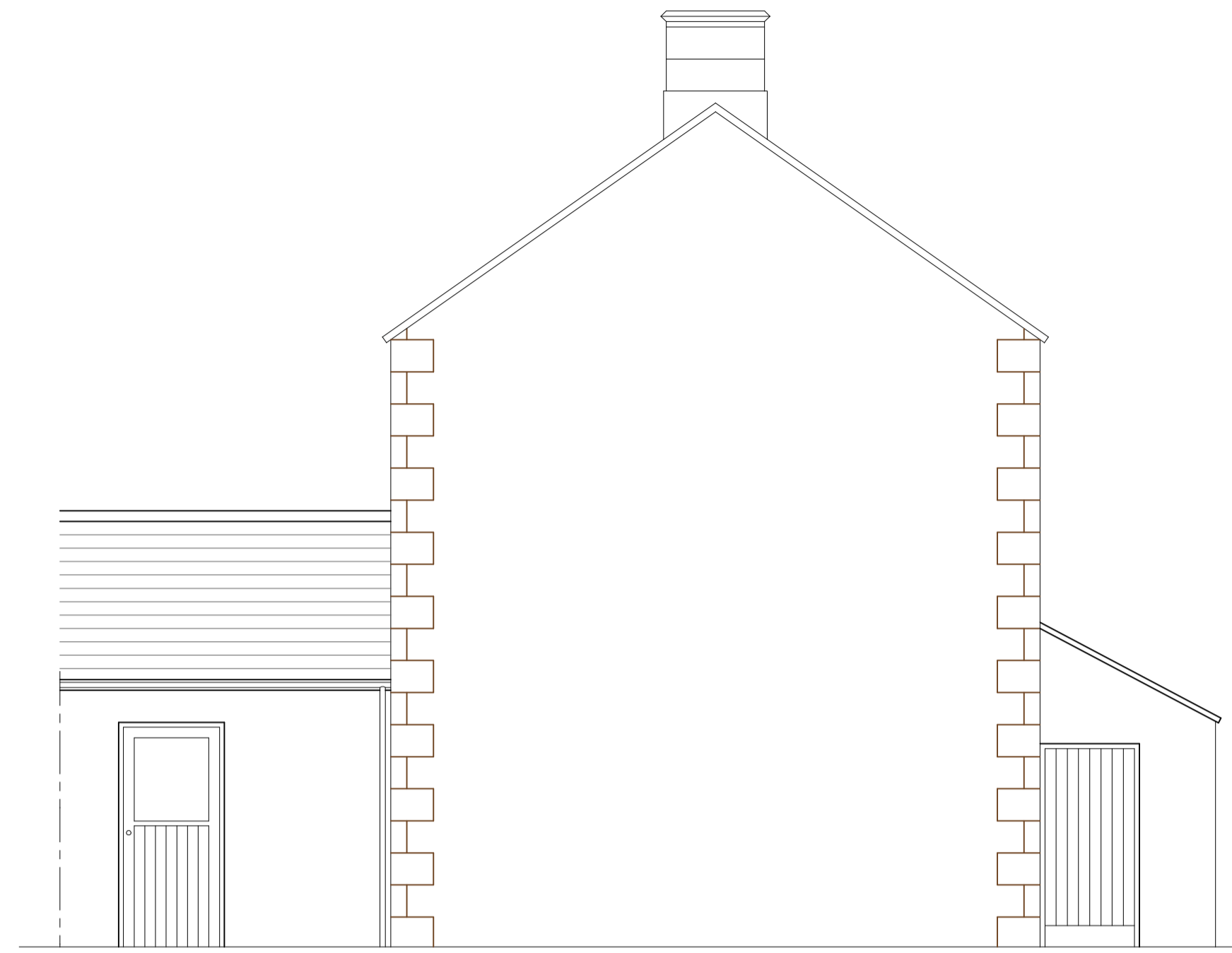
SOUTH EAST ELEVATION ( INNER )