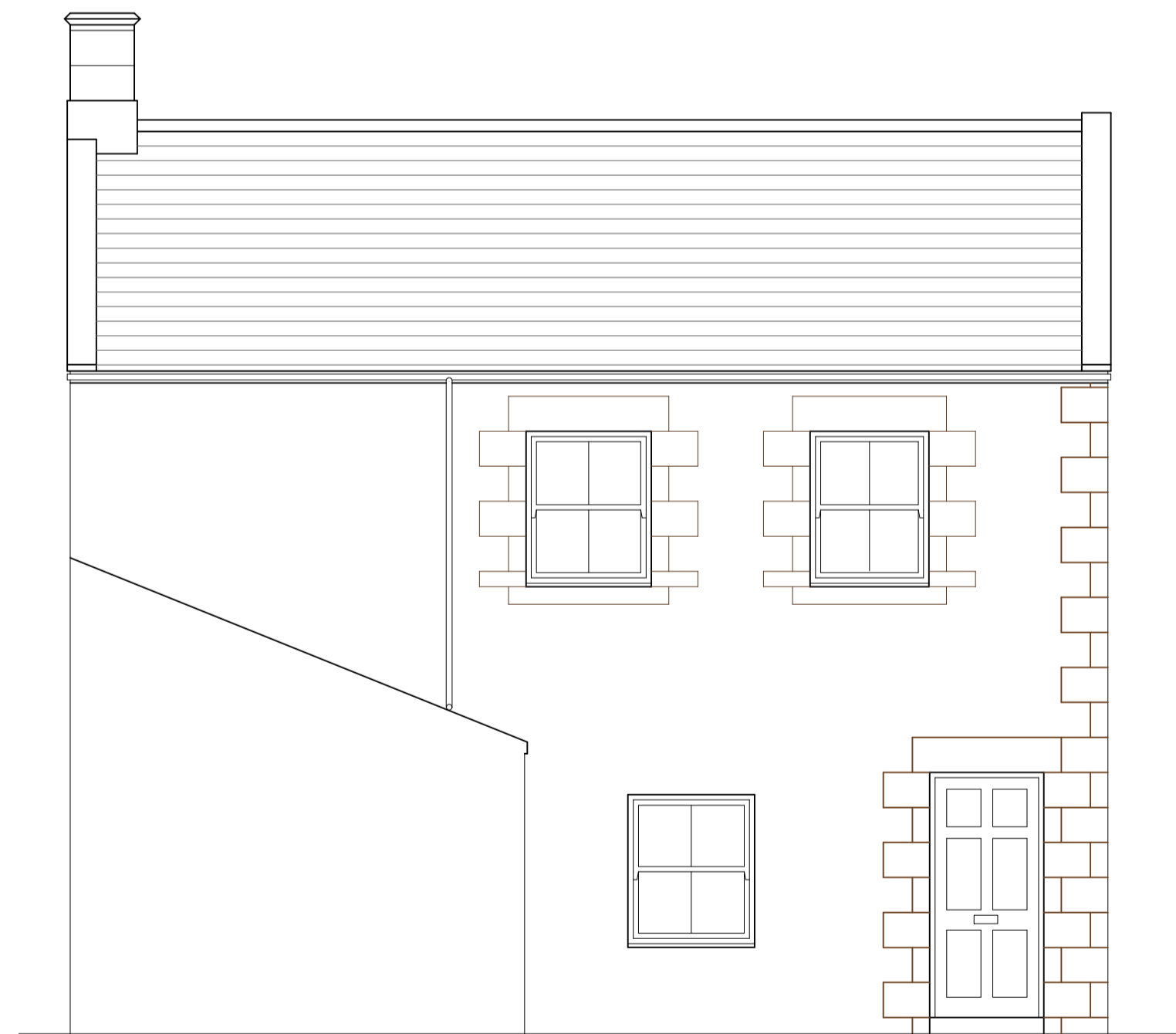
SOUTH WEST ELEVATION ( COTTAGE )