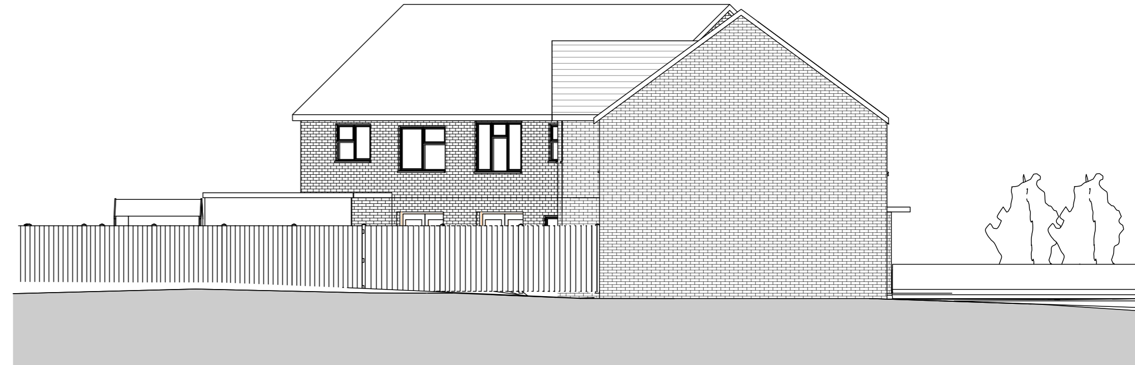
APPROVED SOUTH ELEVATION (SIDE)