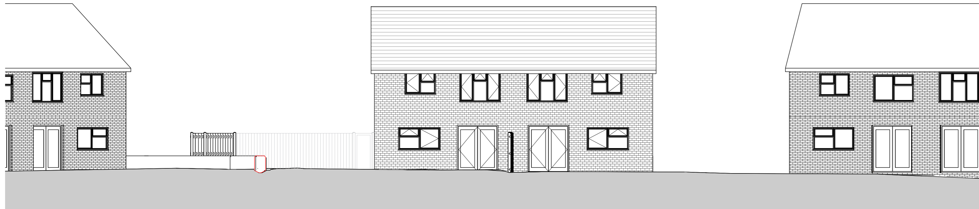
EXISTING WEST ELEVATION (REAR)