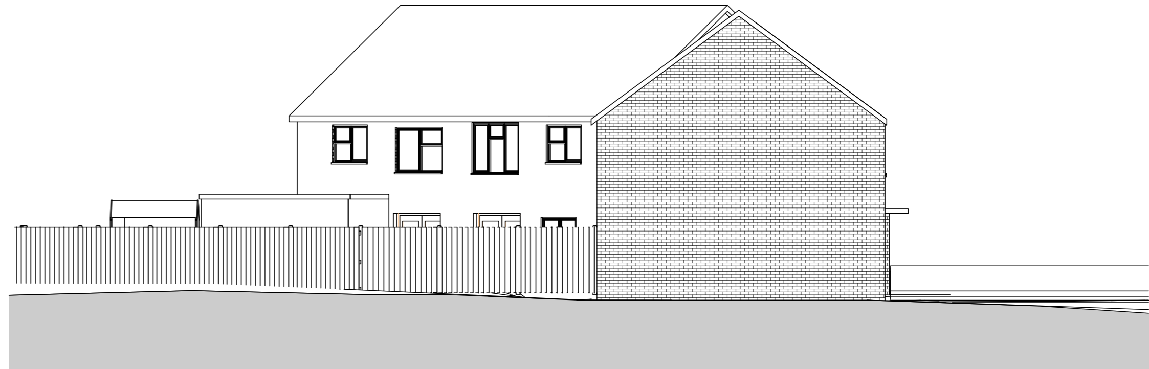
EXISTING SOUTH ELEVATION (SIDE)