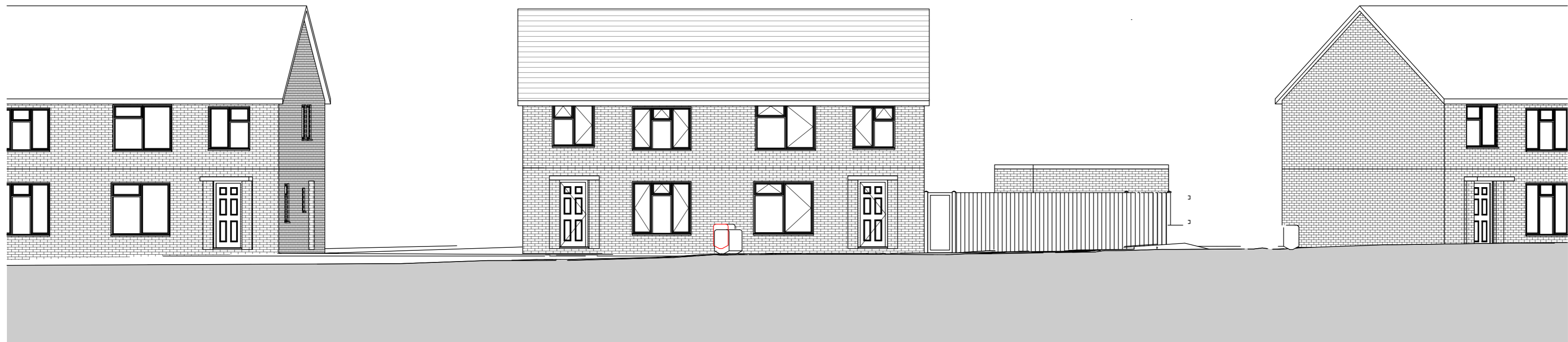
EXISTING EAST ELEVATION (FRONT)

© This drawing is copyright. It is sent to you in confidence and must not be reproduced or disclosed to third parties without our prior permission. Do not scale from this drawing, other than for Local Authority Planning purposes. This drawing is to be read in conjunction with all relevant consultants, specialist manufacturers drawings and specifications. Any discrepancies in dimensions or details on or between these drawings should be drawn to our attention. All dimensions are in millimetres unless noted otherwise.