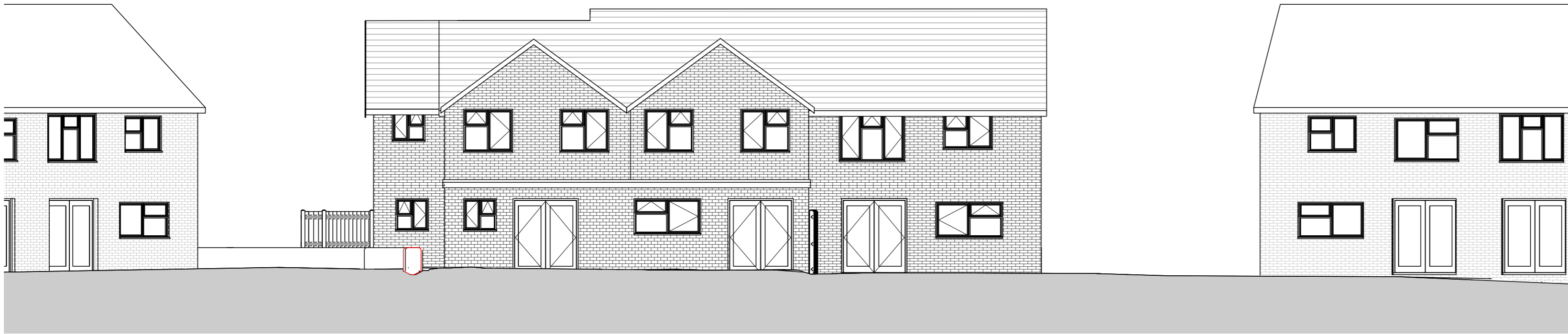
PROPOSED WEST ELEVATION (REAR)