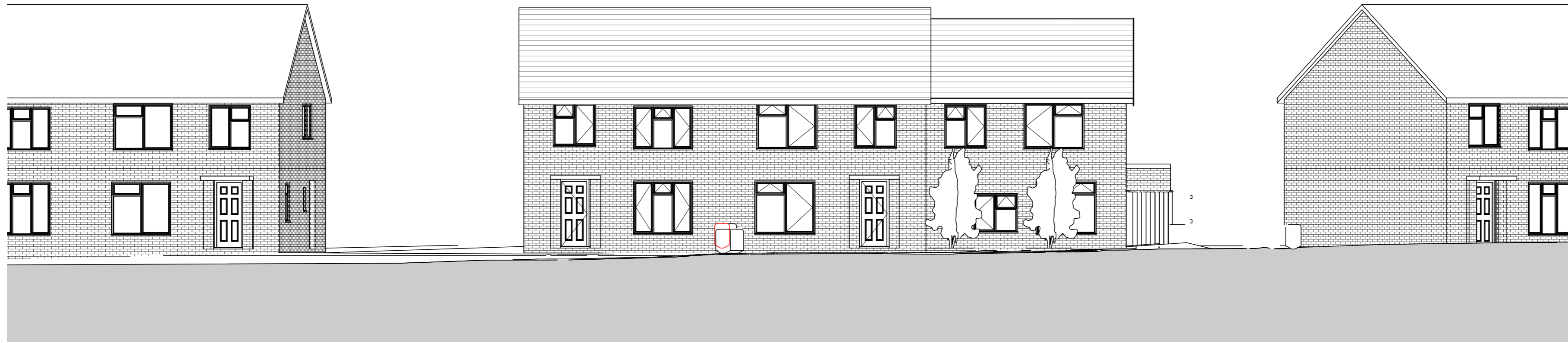
PROPOSED EAST ELEVATION (FRONT) (To remain as approved)

© This drawing is copyright. It is sent to you in confidence and must not be reproduced or disclosed to third parties without our prior permission. Do not scale from this drawing, other than for Local Authority Planning purposes. This drawing is to be read in conjunction with all relevant consultants, specialist manufacturers drawings and specifications. Any discrepancies in dimensions or details on or between these drawings should be drawn to our attention. All dimensions are in millimetres unless noted otherwise.