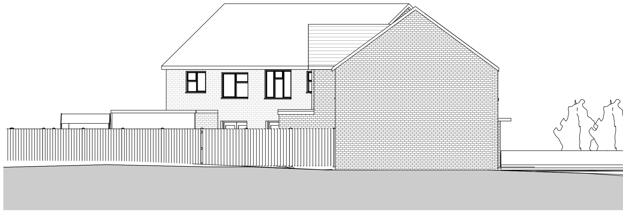
PROPOSED SOUTH ELEVATION (SIDE)