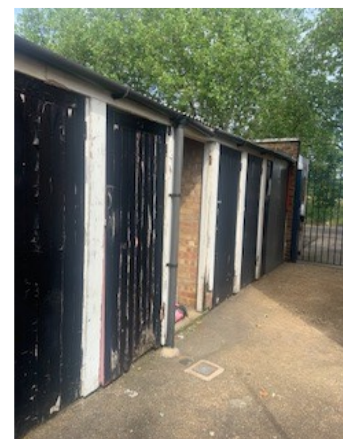
Existing pram sheds