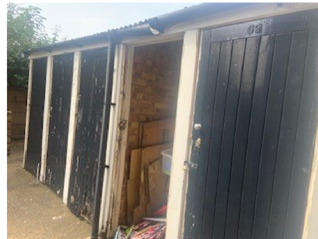
Existing pram sheds