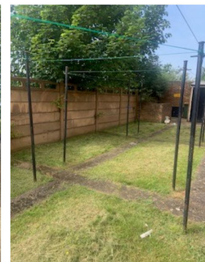
Existing communal garden No65-79