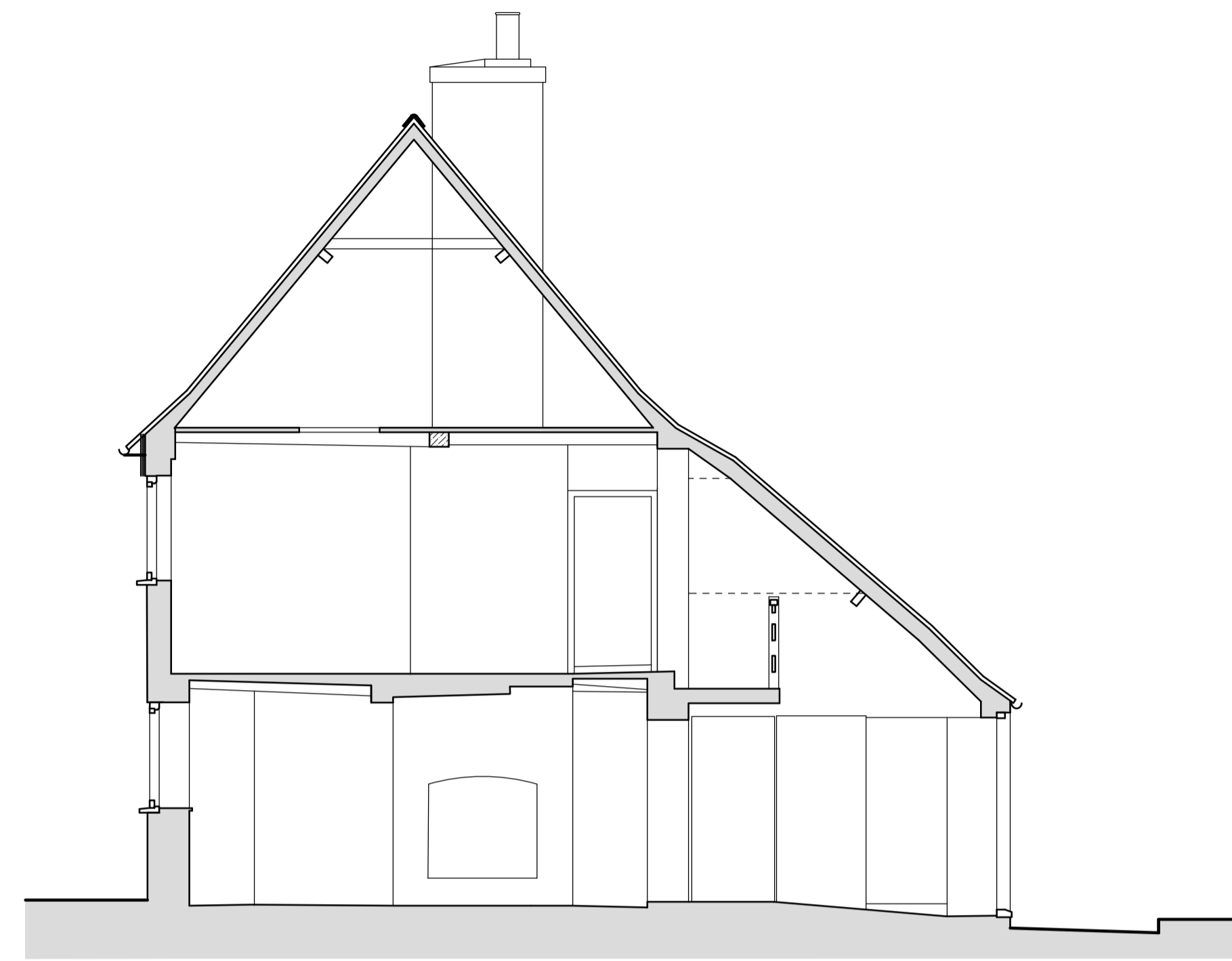
Existing Section A-A