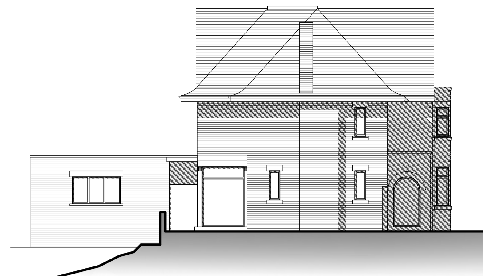
EXISTING SIDE (SOUTHWEST) ELEVATION 1:100