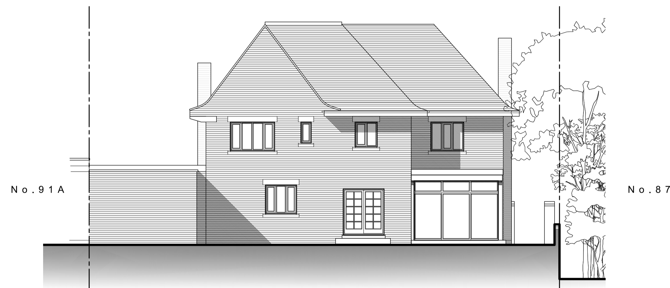
EXISTING REAR (NORTHWEST) ELEVATION 1:100