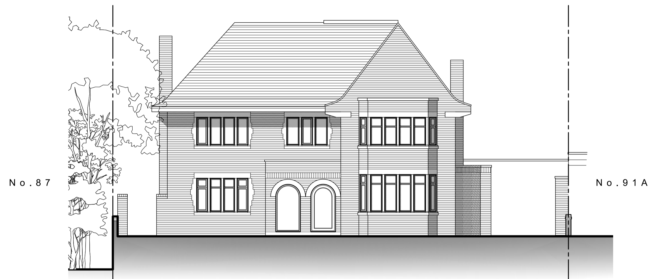
EXISTING FRONT (SOUTHEAST) ELEVATION 1:100

Drawings for planning purposes only, all dimensions to be checked and verified by the contractor prior to work commencing on site. Contractor to ensure all materials are to Local Authority approval and to take into account everything necessary for the proper execution of the works.