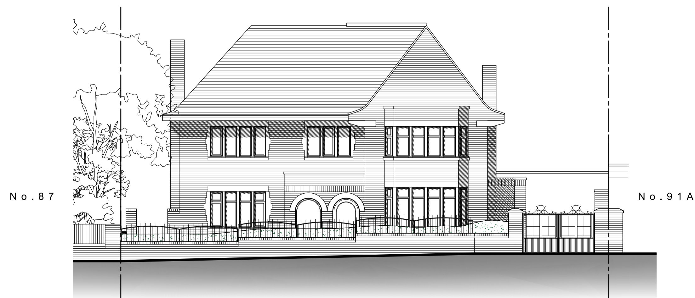
EXISTING NORTH PARK DRIVE (SOUTHEAST) ELEVATION 1:100