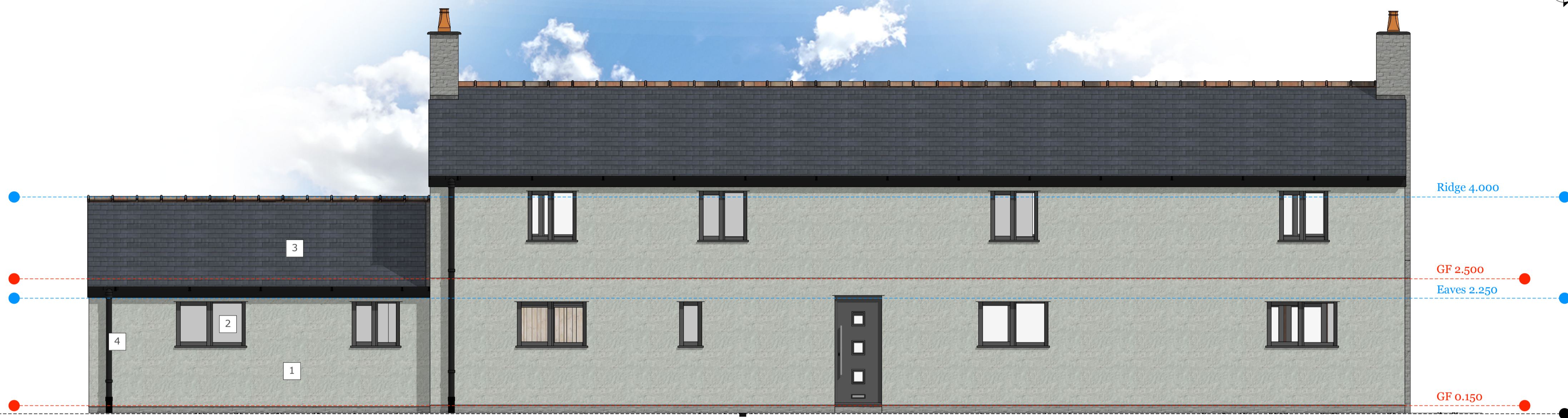
E :: PROPOSED FRONT ELEVATION 1 scale: 1"=50"