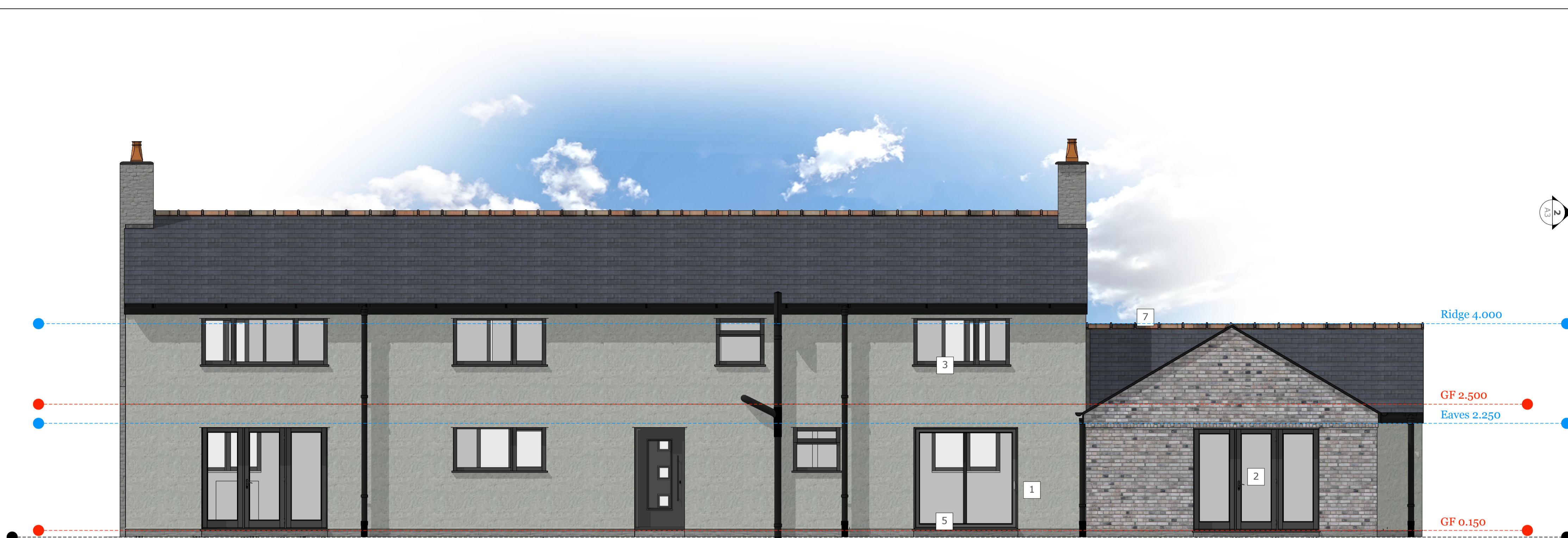
E :: PROPOSED REAR ELEVATION 3 scale: 1"=50"