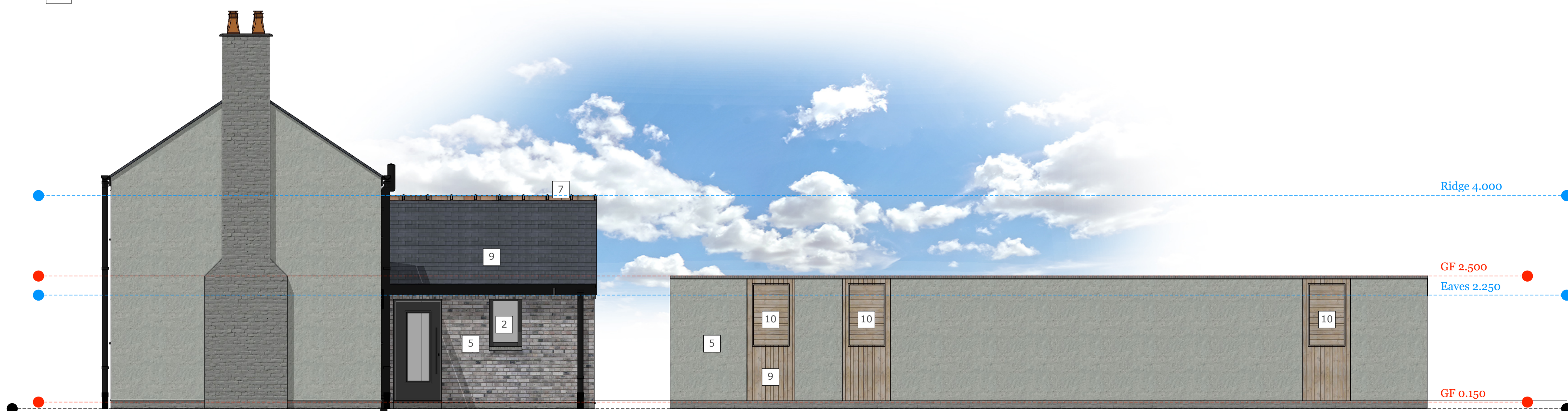
E :: PROPOSED RIGHT ELEVATION 4 scale: 1"=50"