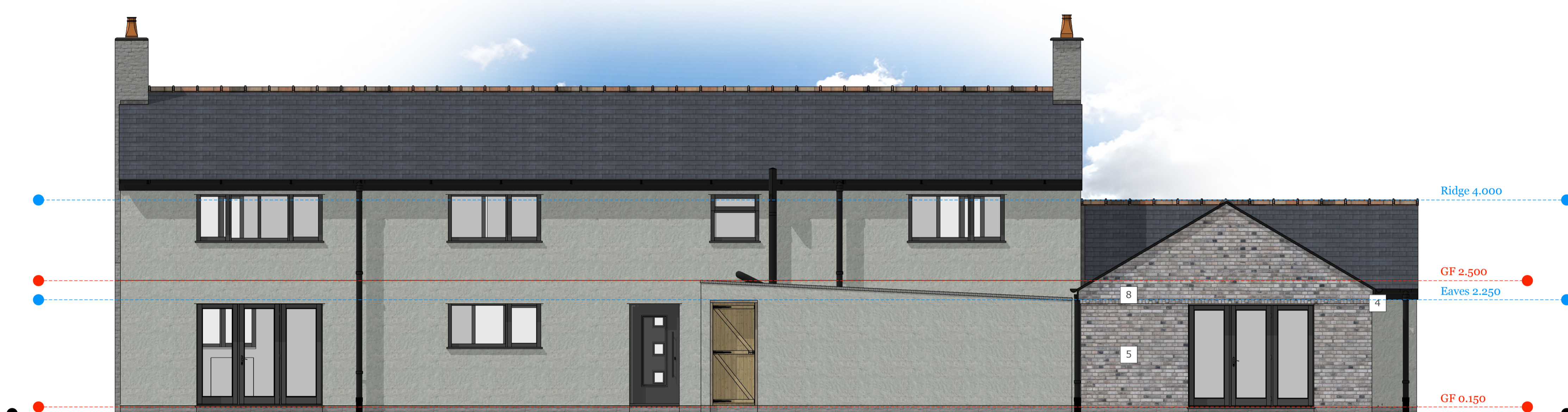
E :: PROPOSED REAR ELEVATION - Inc. 3a scale: 1"=50"