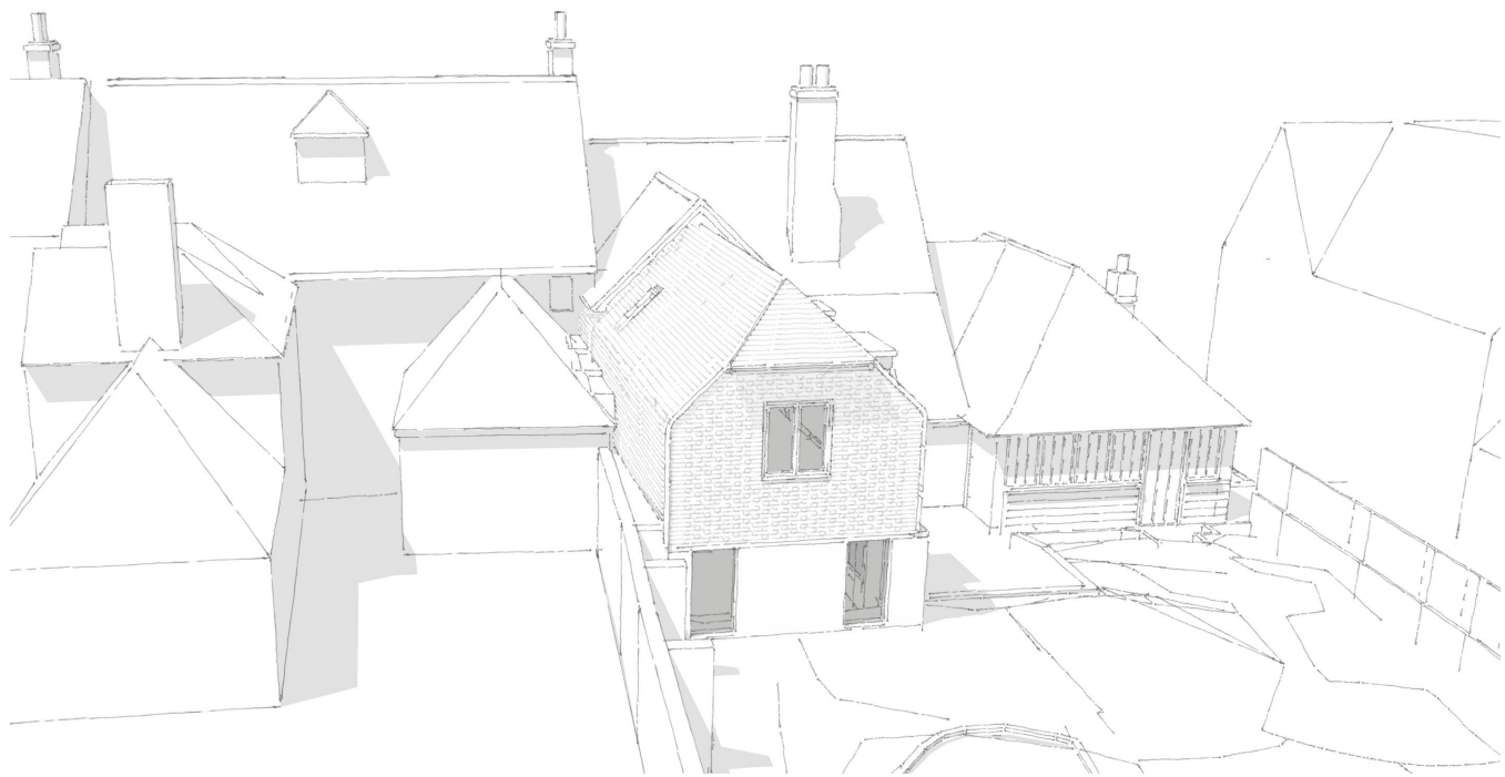
Aerial View: From rear

DO NOT SCALE FROM THIS DRAWING. Scaling only for Local Authority purposes. Dimensions to be checked on site. All dimensions are in millimetres unless stated. Report all discrepancies.