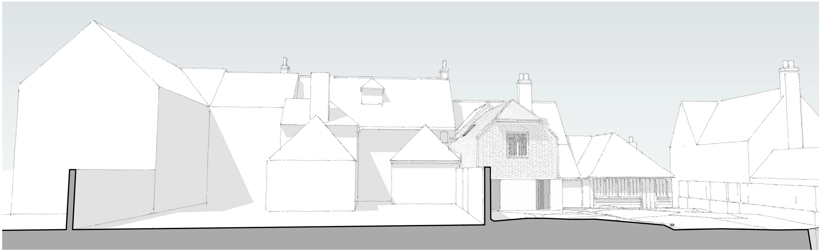
Perspective Long Section: Through Site