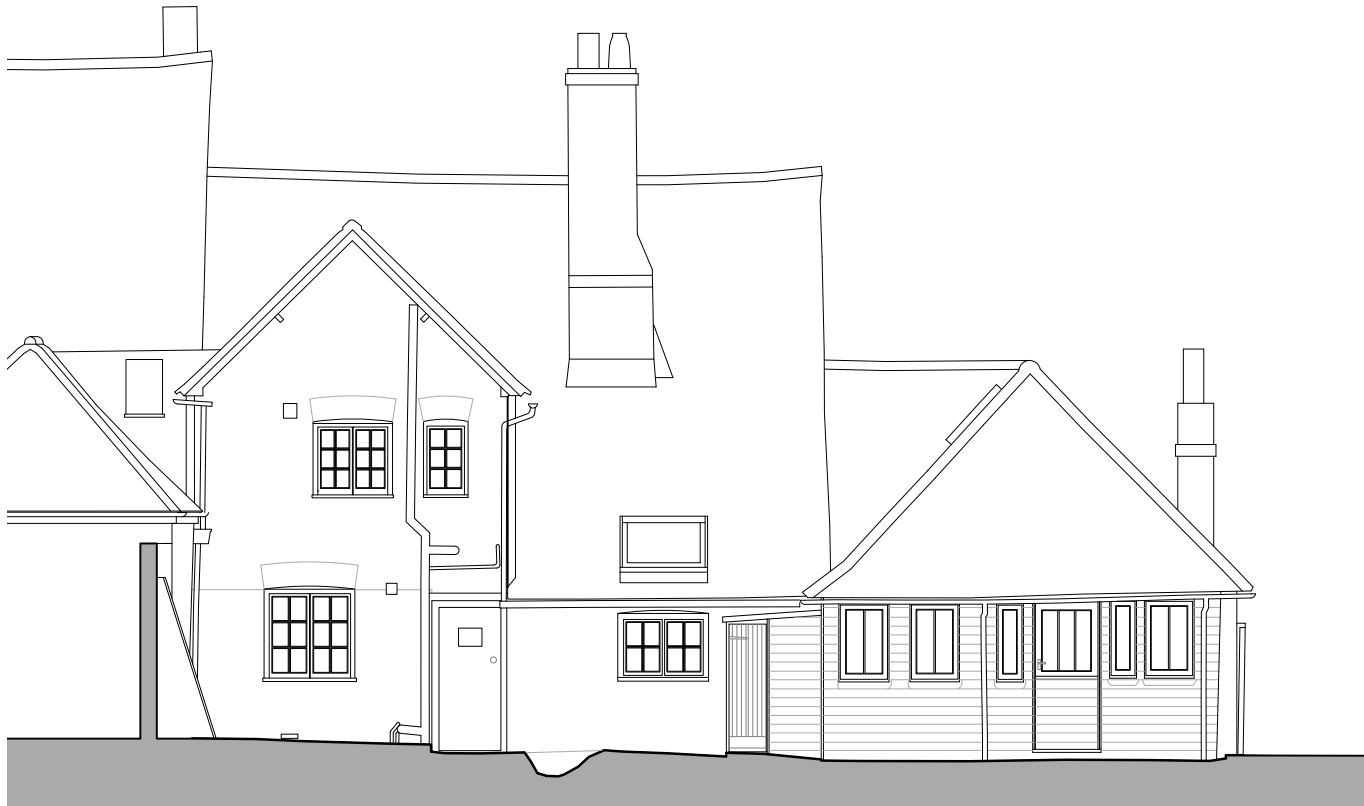
EAST ELEVATION 1:100 EXISTING