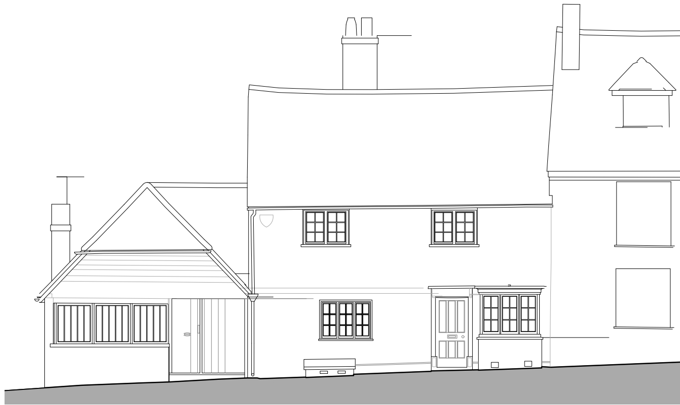
WEST ELEVATION 1:100 EXISTING