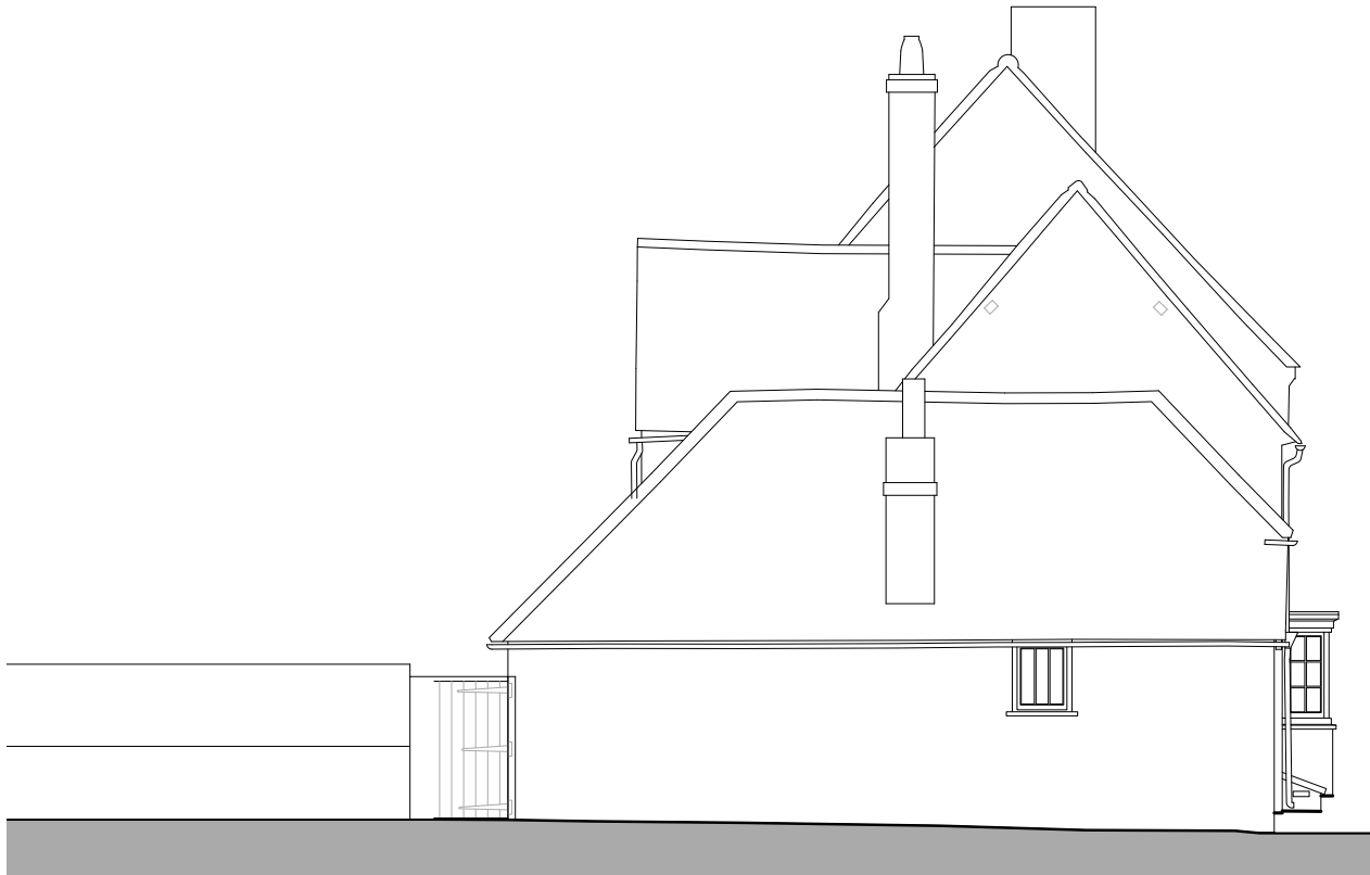
NORTH ELEVATION 1:100 EXISTING

DO NOT SCALE FROM THIS DRAWING. Scaling only for Local Authority purposes. Dimensions to be checked on site. All dimensions are in millimetres unless stated. Report all discrepancies.