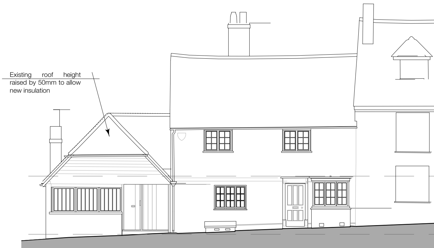
WEST ELEVATION 1:100 PROPOSED