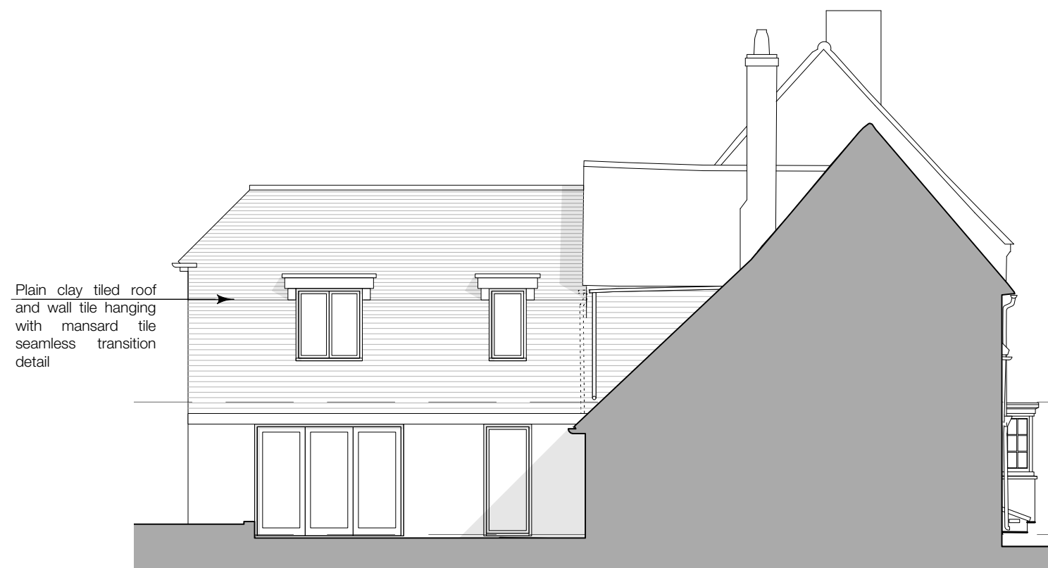
NORTH ELEVATION 1:100 PROPOSED

DO NOT SCALE FROM THIS DRAWING. Scaling only for Local Authority purposes. Dimensions to be checked on site. All dimensions are in millimetres unless stated. Report all discrepancies.