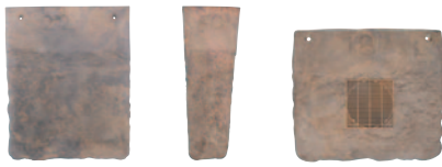
Main slate Centre slip slate Slate vent