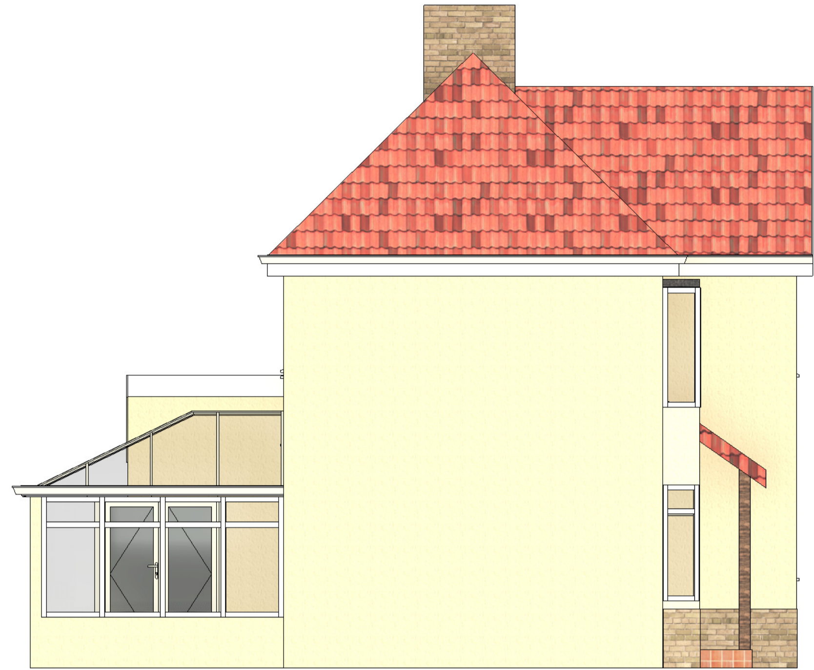
1 East Ex 1 : 50