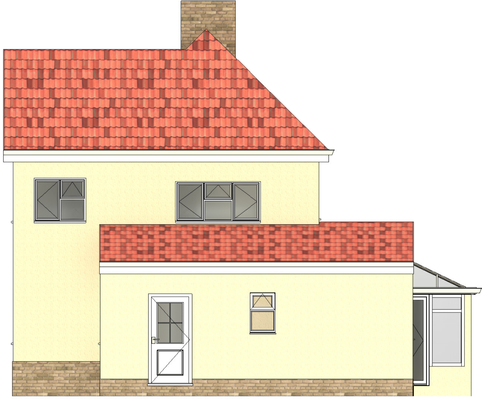
4 West Ex 1 : 50

NOTES : Report any discrepancies or omissions between the 'Designer' and any consultants drawings to the designer immediately. Do not scale from Drawings. All dimensions to be checked by contractor on site prior to commencing any work. IF IN DOUBT ASK. Levels and dimensions of existing structure/site may be from various sources and may be inaccurate. Unless stated otherwise this drawing is for design intent purposes only and should not be used for any other purpose. The drawing is indicative of designers visual requirements. COPYRIGHT : This document is the property of Arcitek Building Design Ltd and copyright is reserved by them. No unauthorised copying, in whole or part part or any form of reproduction is permitted. It must not be retained for reference and the contents may not be disclosed to any third party without the special written consent of Arcitek Building Design Ltd. CDM : This drawing represents design intent only and should not be used for construction purposes without written notification from Principle Designer REVISIONS : Recycle all previous versions of this drawing and check with designer that you have the latest revision.