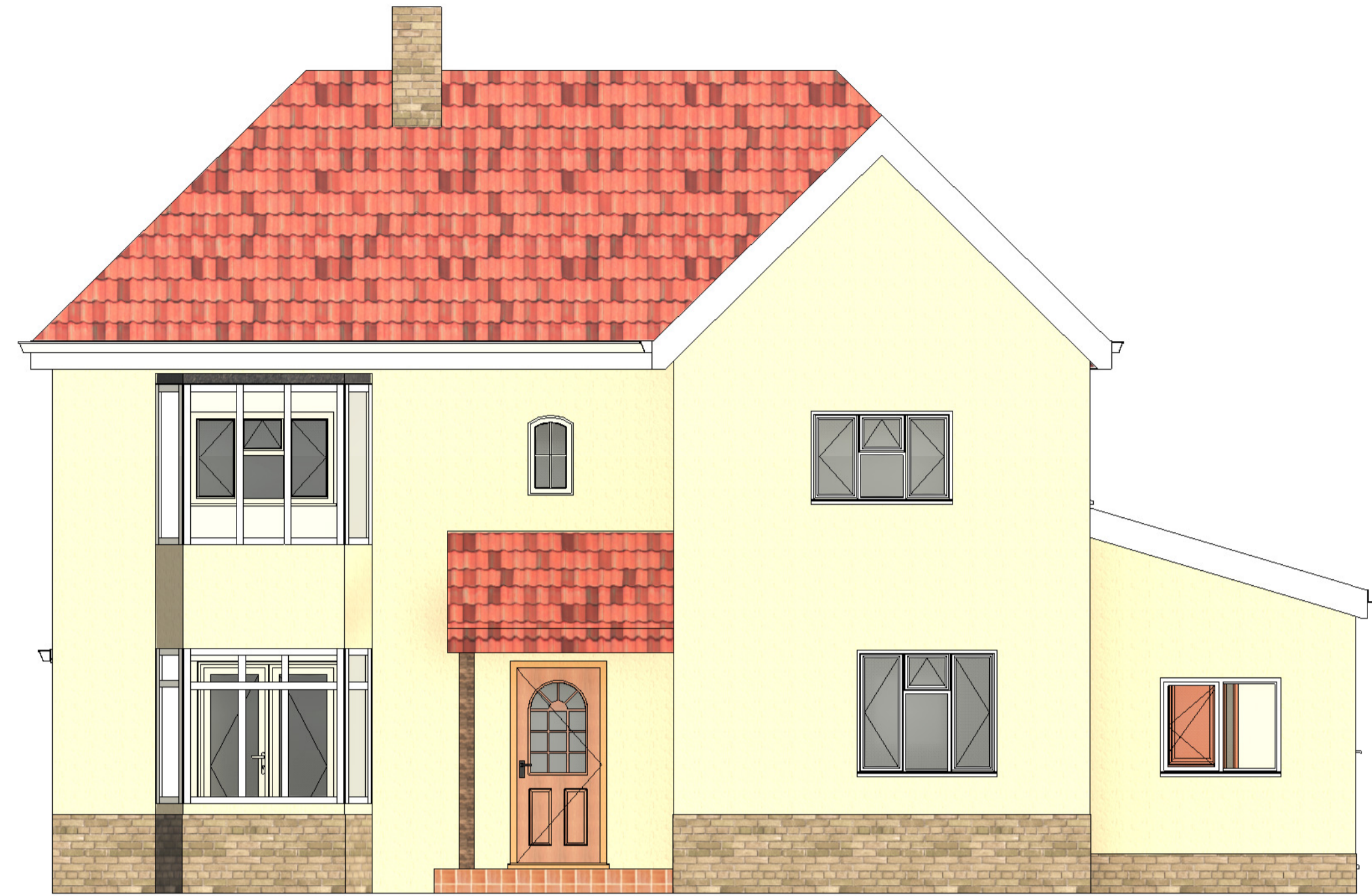
2 North Ex 1 : 50