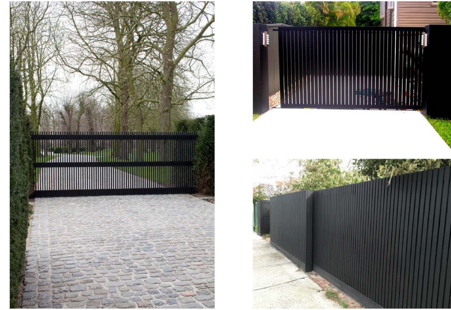
Indicative precedent images suggesting the style of entrance gate that will be created