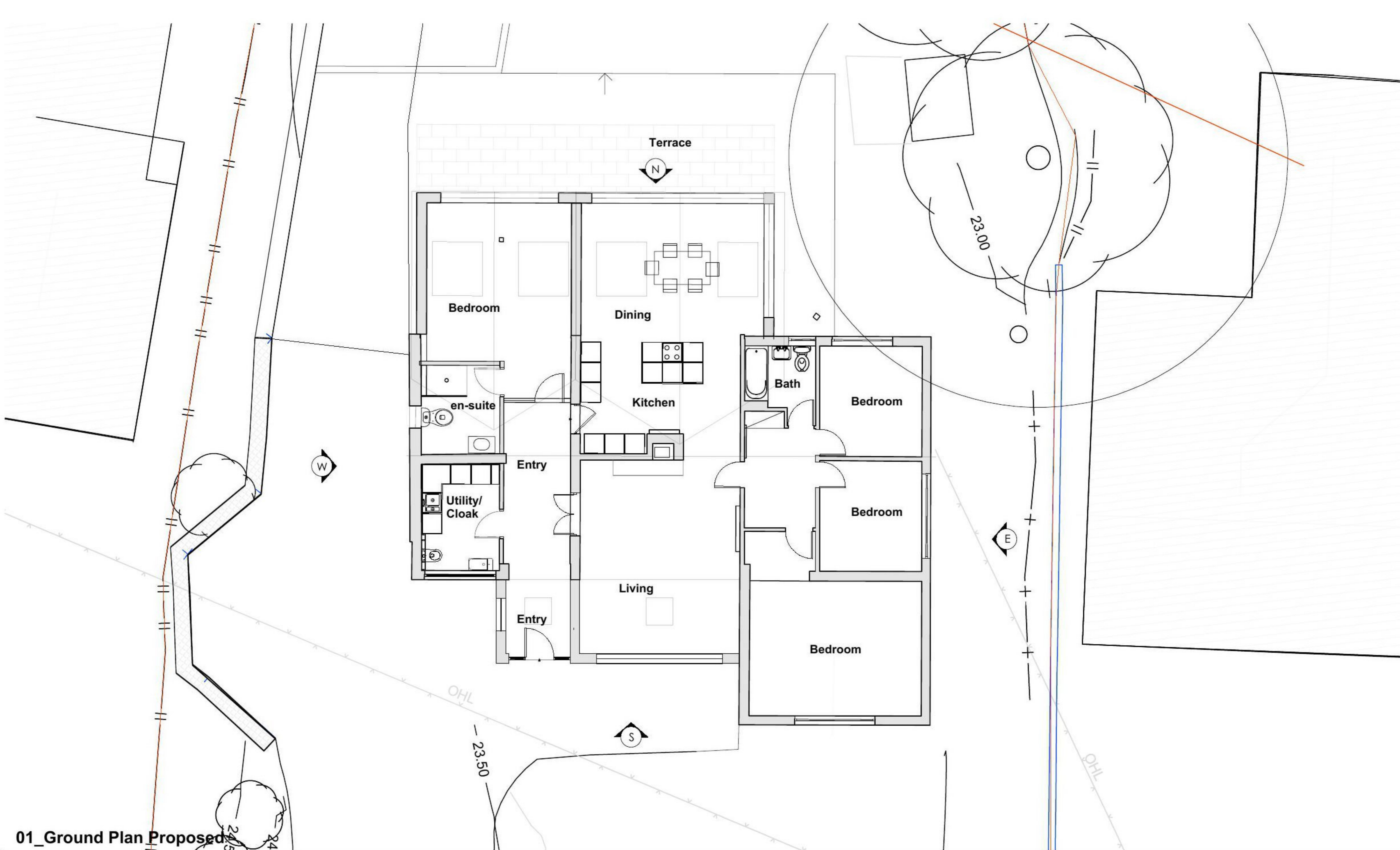
01_Ground Plan Proposed