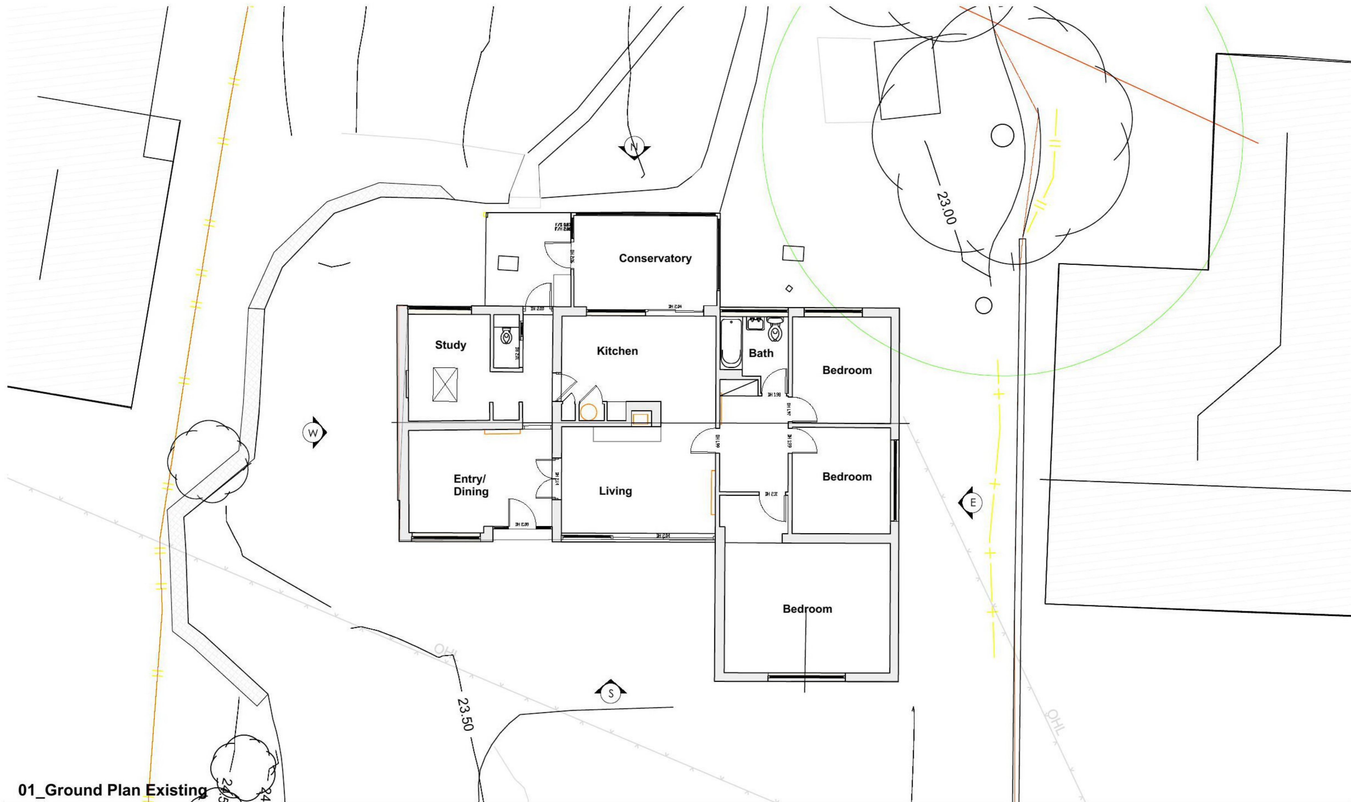
01_Ground Plan Existing