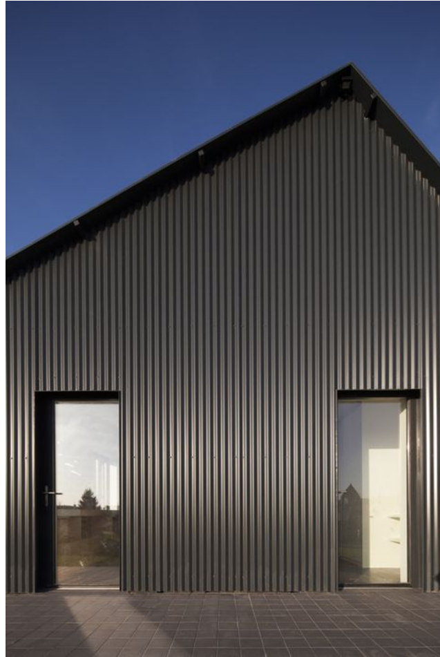
1 Metal Cladding Scale: NTS