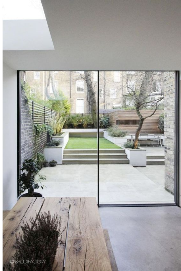
2 Thin Framed Windows/ Concrete Floor Scale: NTS