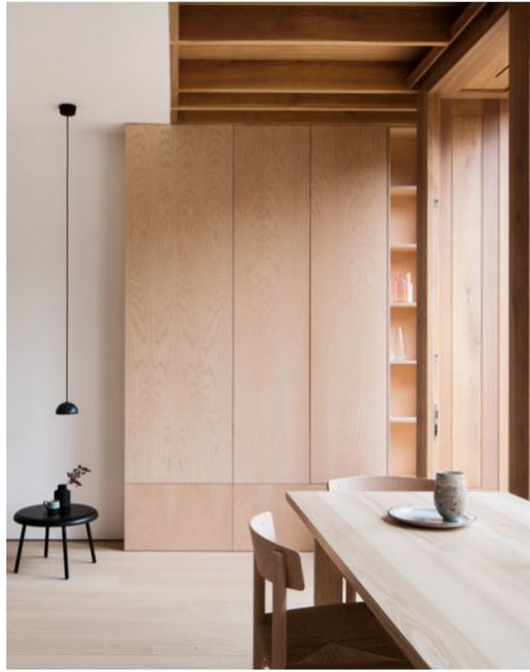
3 Exposed Timber Rafters and Timber Cladding Scale: NTS