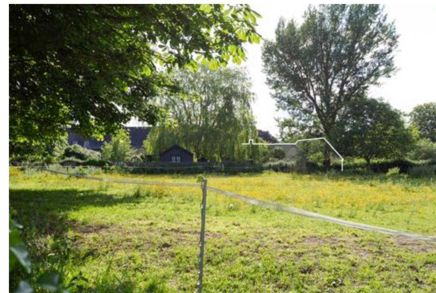
4 Proposed View across paddock from Barton Lane