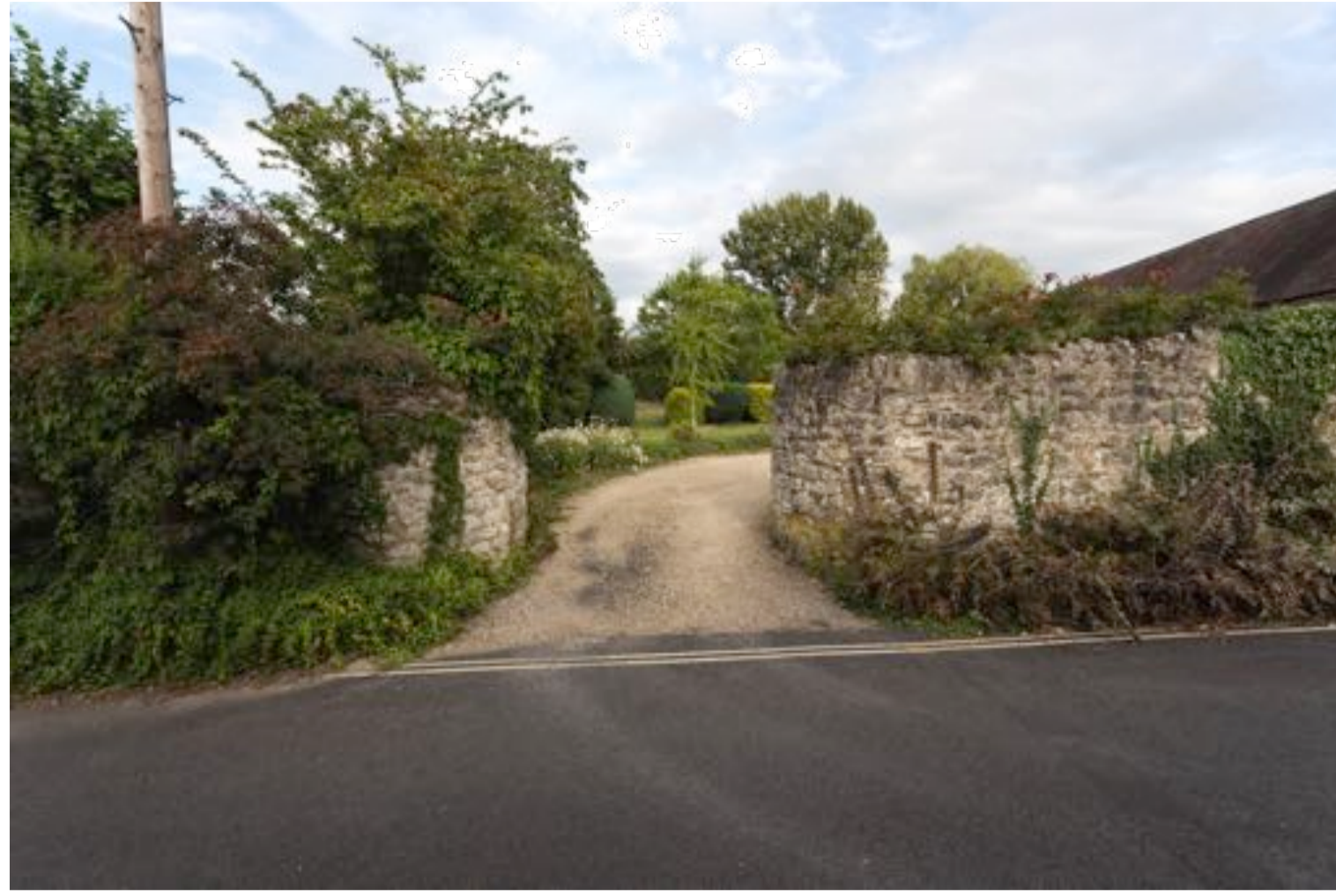
1 Existing View from Larkins Lane