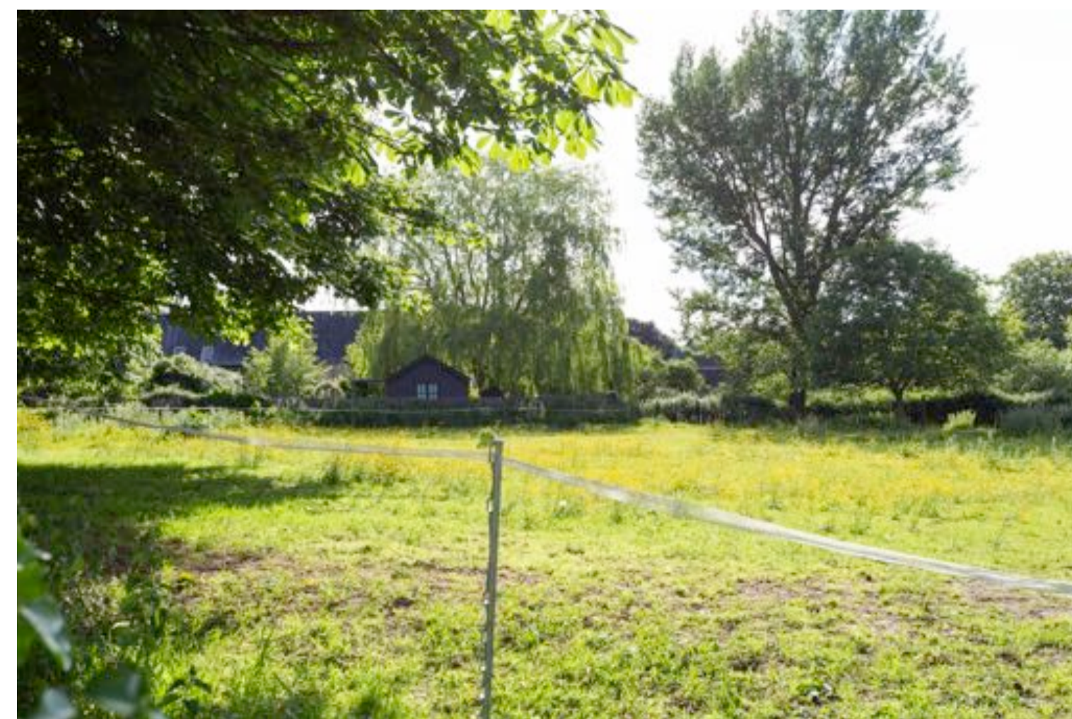
3 Existing View across paddock from Barton Lane