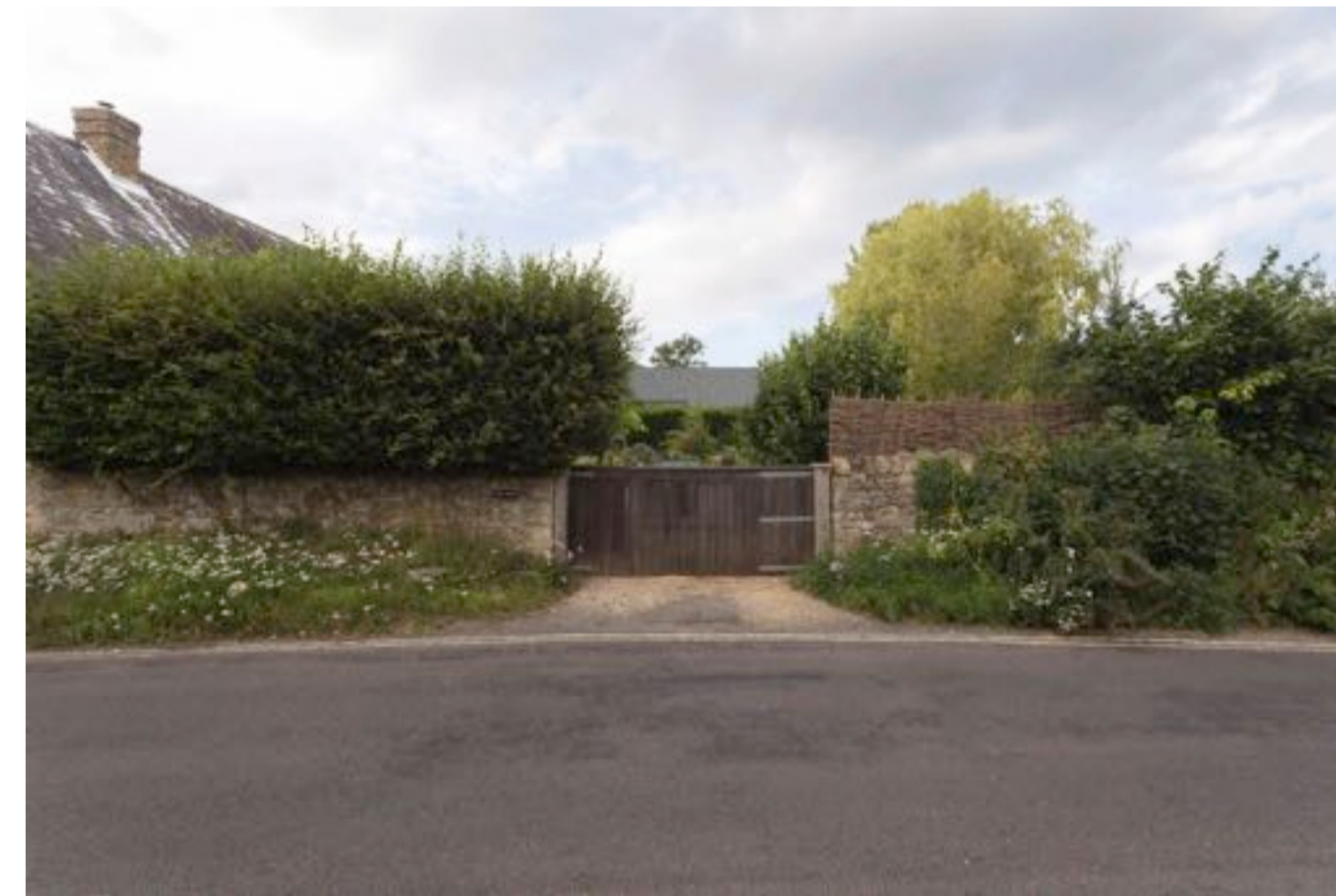
4 Proposed View over gate of 58 Barton Lane