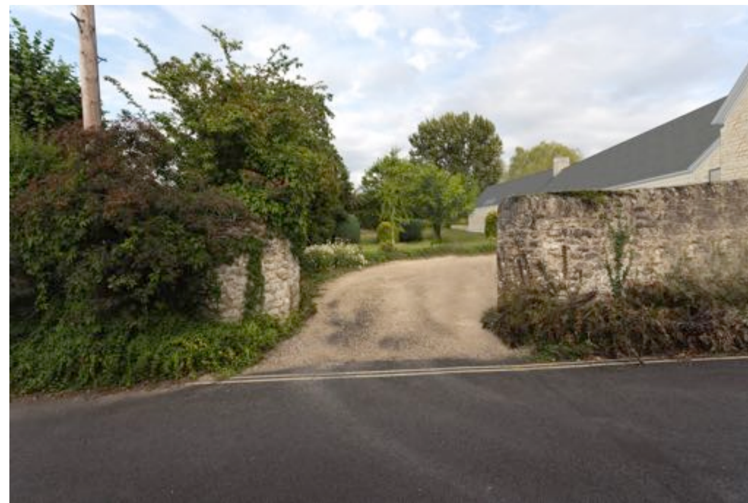
2 Proposed View from Larkins Lane (not verified)