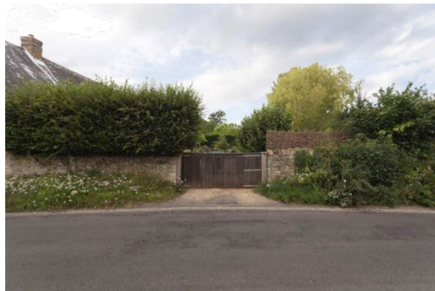
3 Existing View over gate of 58 Barton Lane