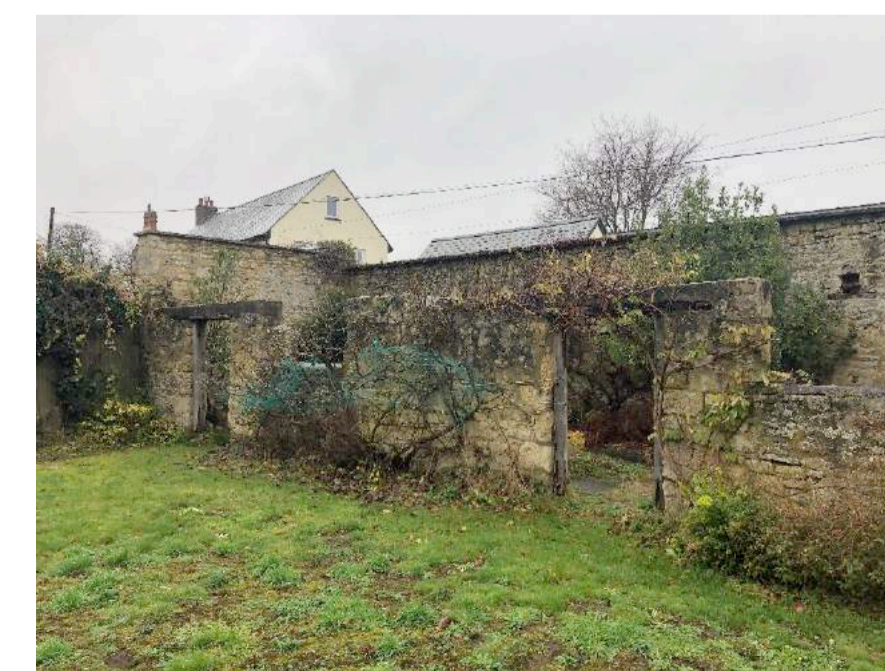
h. View of the ruins of the old cowshed