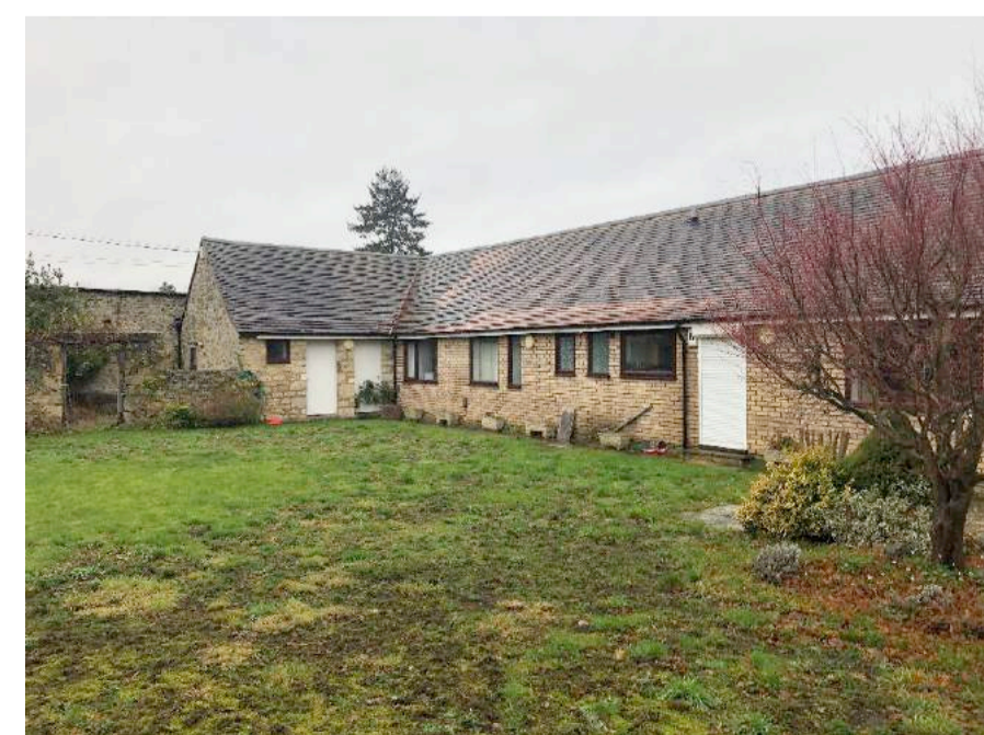
e. View from courtyard garden showing 1970s brickwork to south elevation and exterior of utility showing example of poor quality modern stonework.