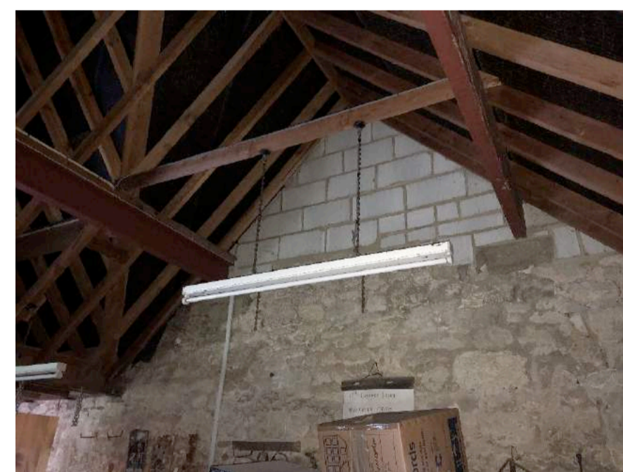
c. Interior of garage showing modern blockwork alterations to create the gable of the stables and new roof structure