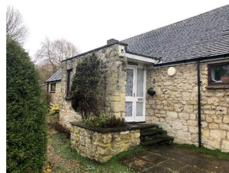
g. View of the 1970s porch showing modern alterations and poor quality reconstruction and repointing of the stonework.