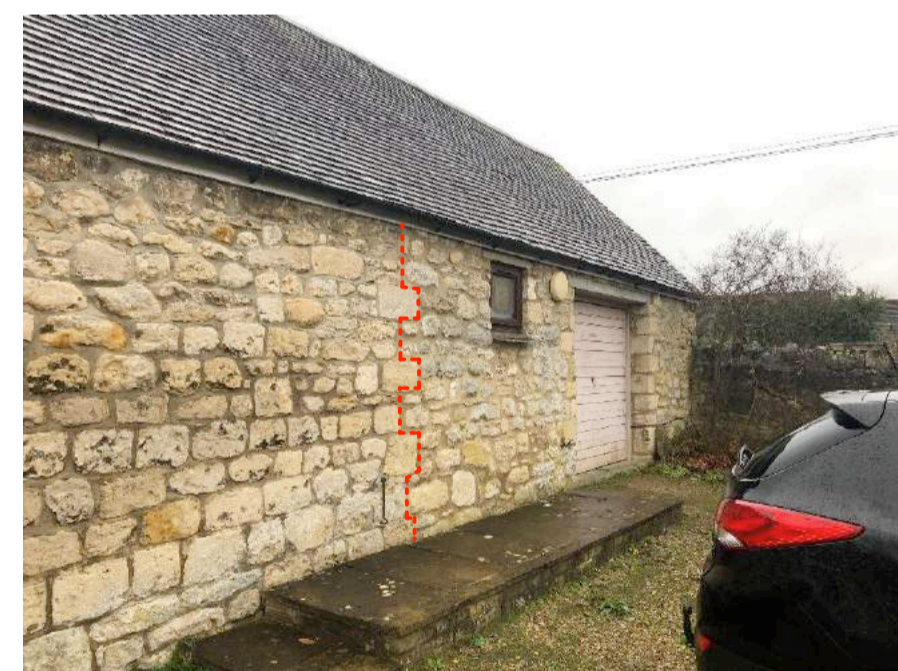
a. 1970s alterations clearly visible around creating of opening for garage door and removal of original gable and break in building line

Indicative elevation showing the extent of stonework believed to be modern additions or reconstruction dating back to the 1976 conversion to a dwelling house in yellow. Stonework believed to be original is unhatched. Retention of original stonework in this facade to be finally determined following appointment of main contractor and further on site investigation to establish structural stability. New and replacement stonework will be limestone to match the existing. The remediation and replacement of the poor quality 1970s stonework and pointing in this elevation will improve the quality and character of the building and improve its contribution to the Conservation Area. Additions and alterations as part of works in 1976 are identified within the heritage impact assessment, please refer pages 20-29 of this document for further detail.