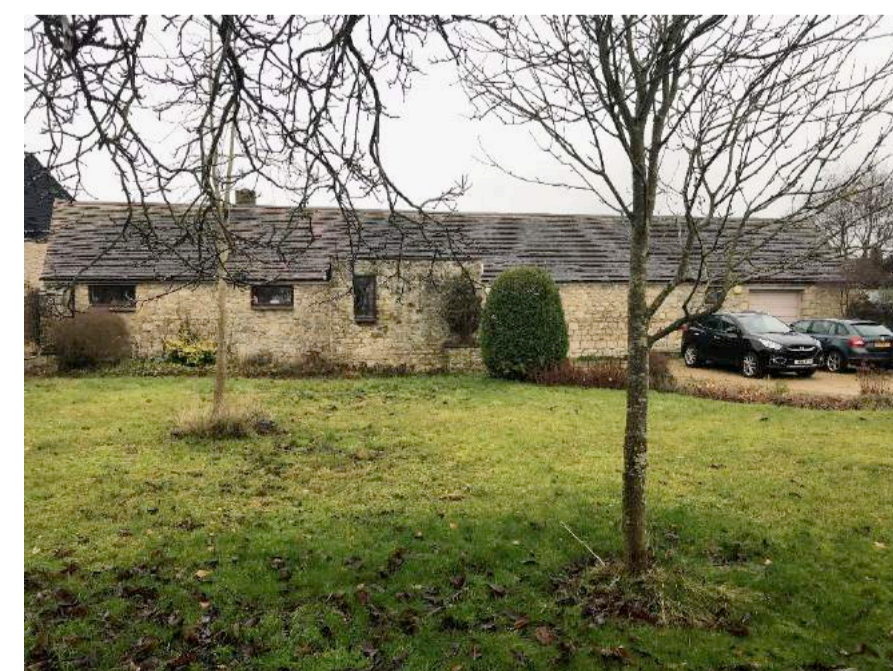
f. View of the north elevation showing 1970s additions of porch and extensive poor quality modern stonework