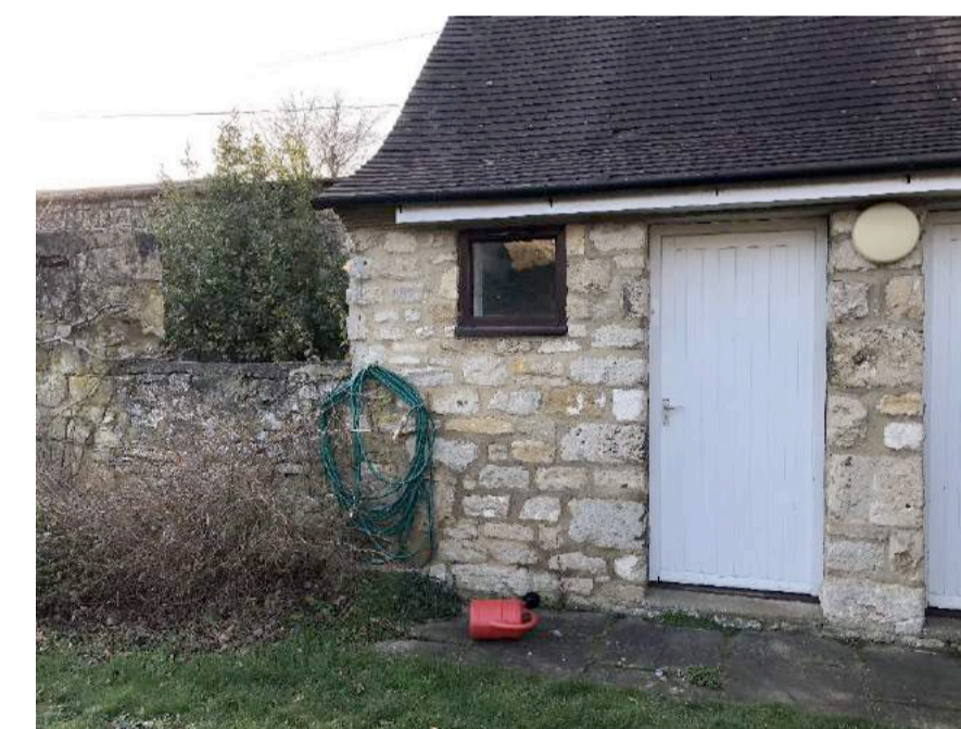
d. Exterior of utility showing example of the modern alterations and poor quality repointing to the stonework evident throughout the building.