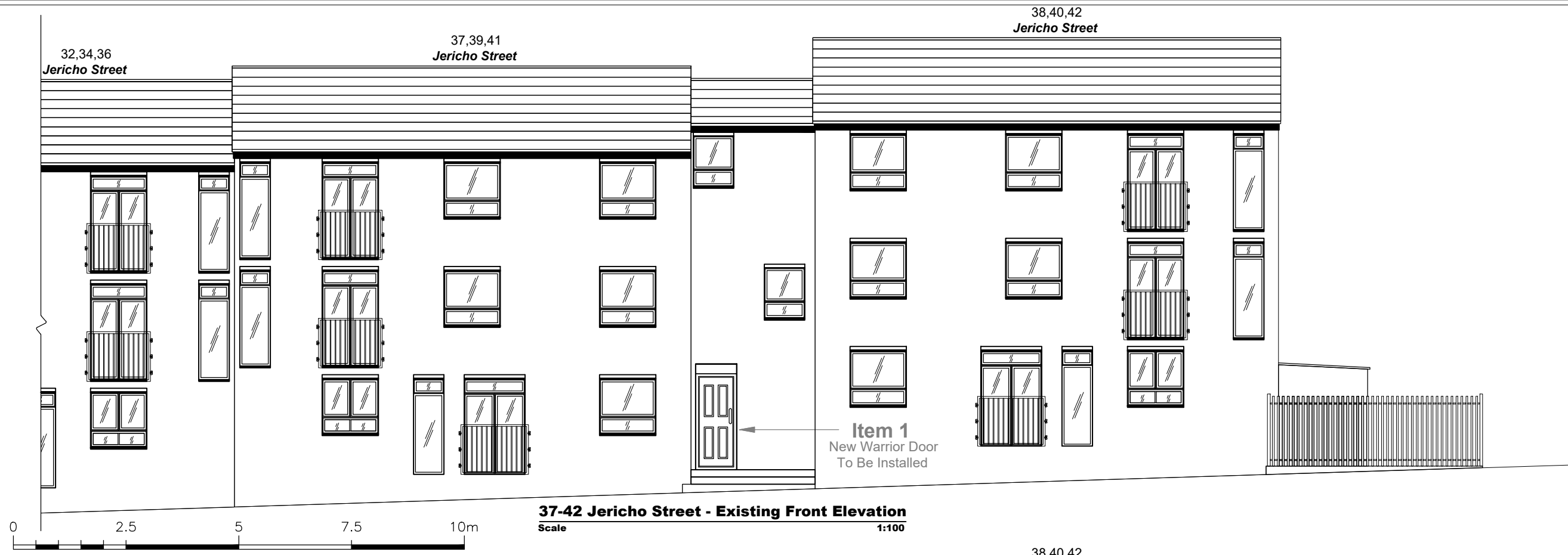
37-42 Jericho Street - Existing Front Elevation Scale 1:100