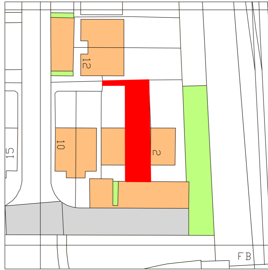
Site Plan 1:500 @ A3