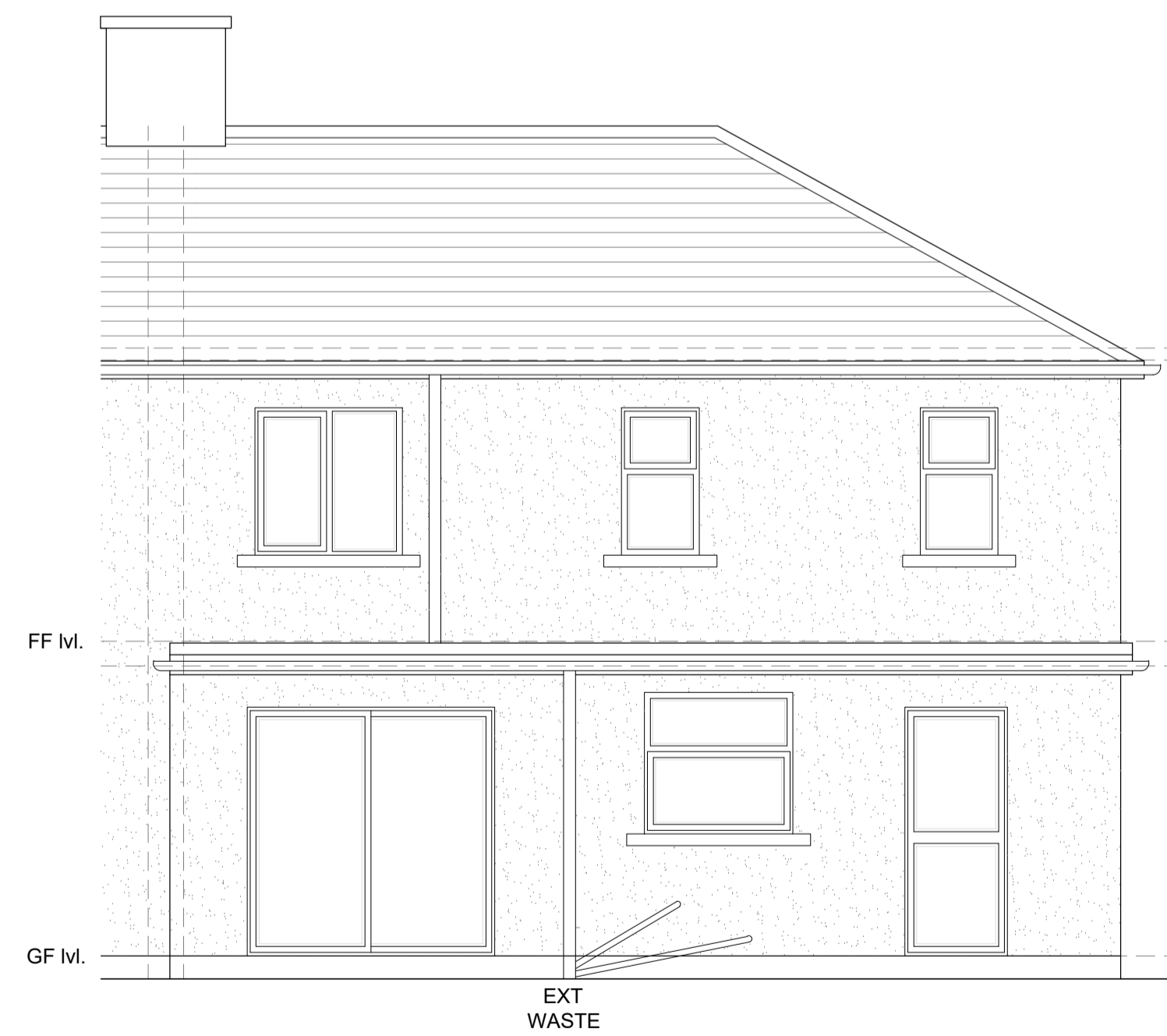
EXISTING REAR ELEVATION SCALE 1:50