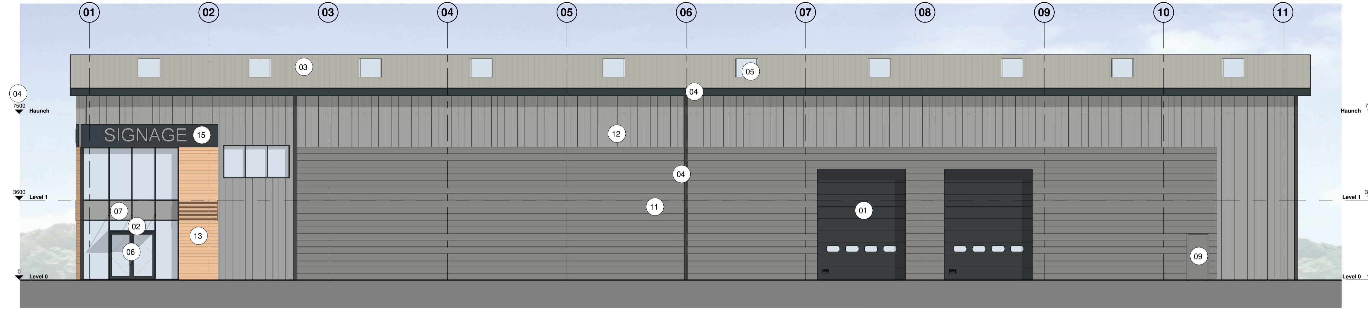
1 21-ZZ Unit 03_ Indicative Elevation A 1:100