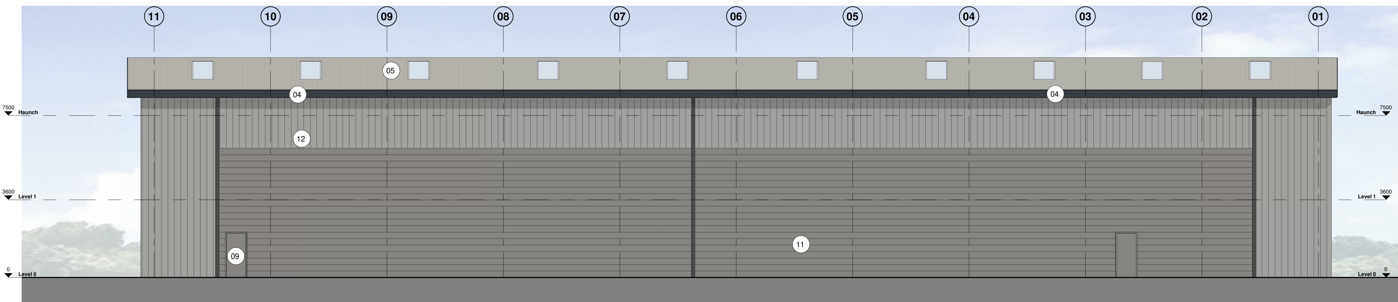
4 21-ZZ Unit 03_ Indicative Elevation D 1:100