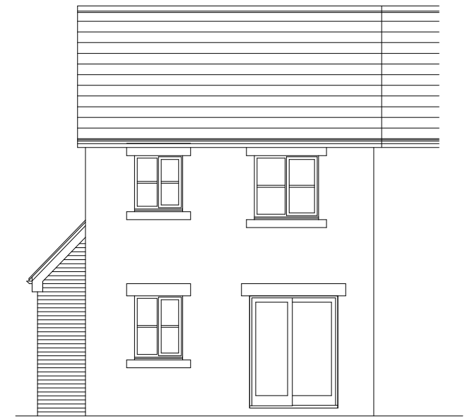
Proposed South East Elevation ( scale 1:100@A3 )