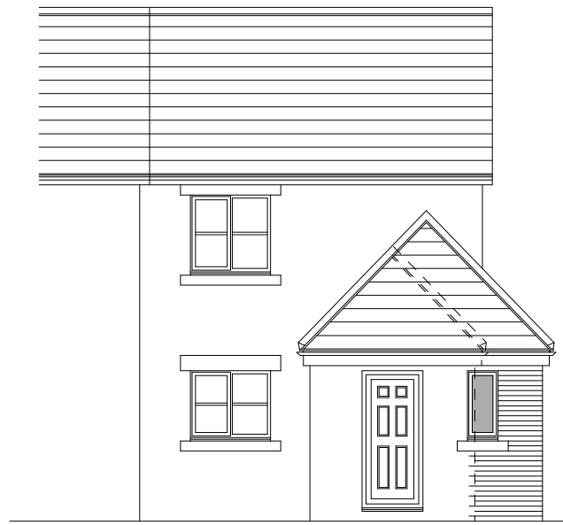
Proposed North West Elevation ( scale 1:100@A3 )