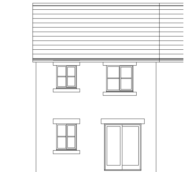
Existing South East Elevation ( scale 1:100@A3 )