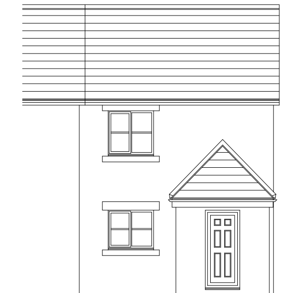
Existing North West Elevation ( scale 1:100@A3 )