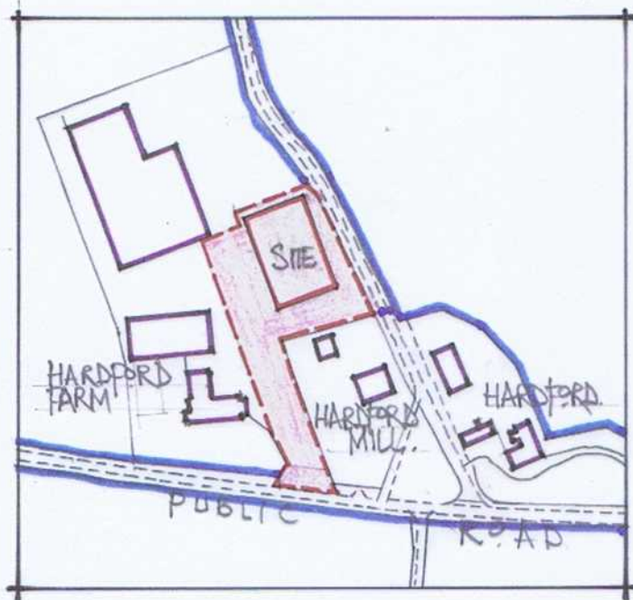
SITE PLAN. 1:2,500.