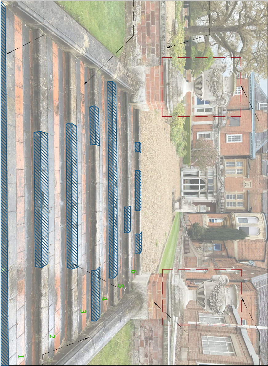
EXISTING TERRACE STEPS NO.02 - PHOTO WITH REPAIR NOTES

Notes: This drawing is the copyright of Giles Quarme Architects and cannot be printed or re-produced without prior permission. Do not scale. This drawing has been based on survey information provided by On Centre Surveys. All dimensions and setting out must be verified on site before commencement of the work, and any discrepancies notified to the architect. All windows and doors are to fit into existing openings. All dimensions are in millimetres unless stated otherwise.