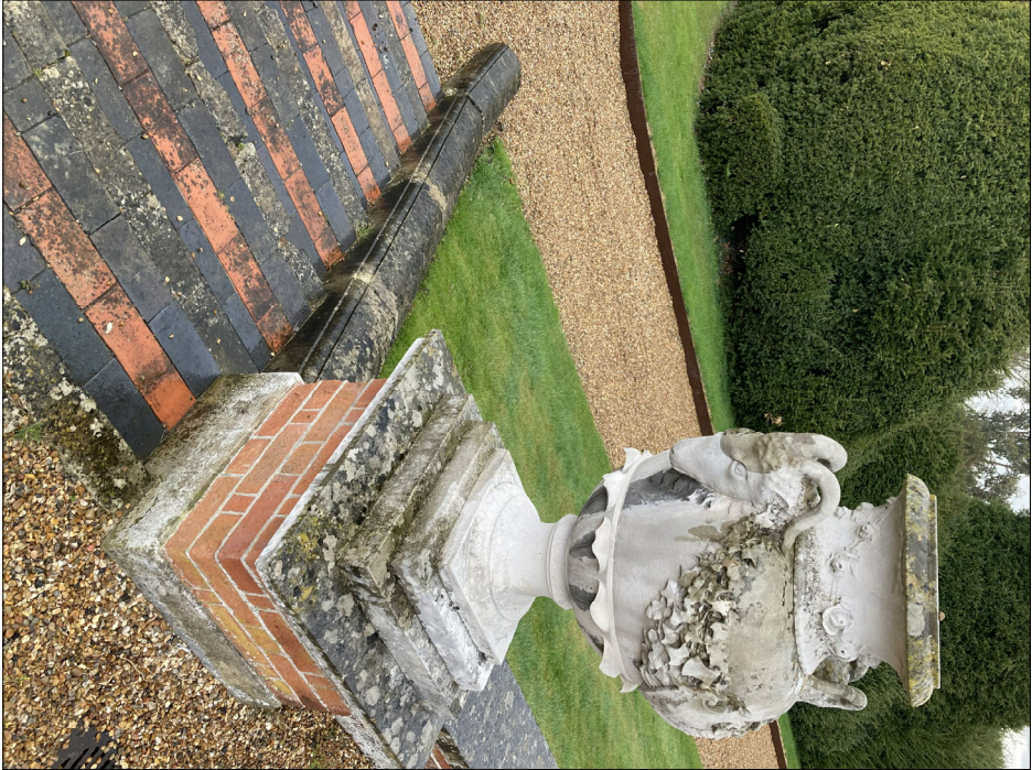
EXISTING STEPS NO.02 - URN AND PIER