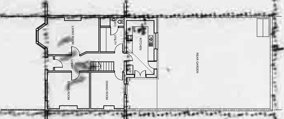
○ BLOCK PLAN 1:200@A3