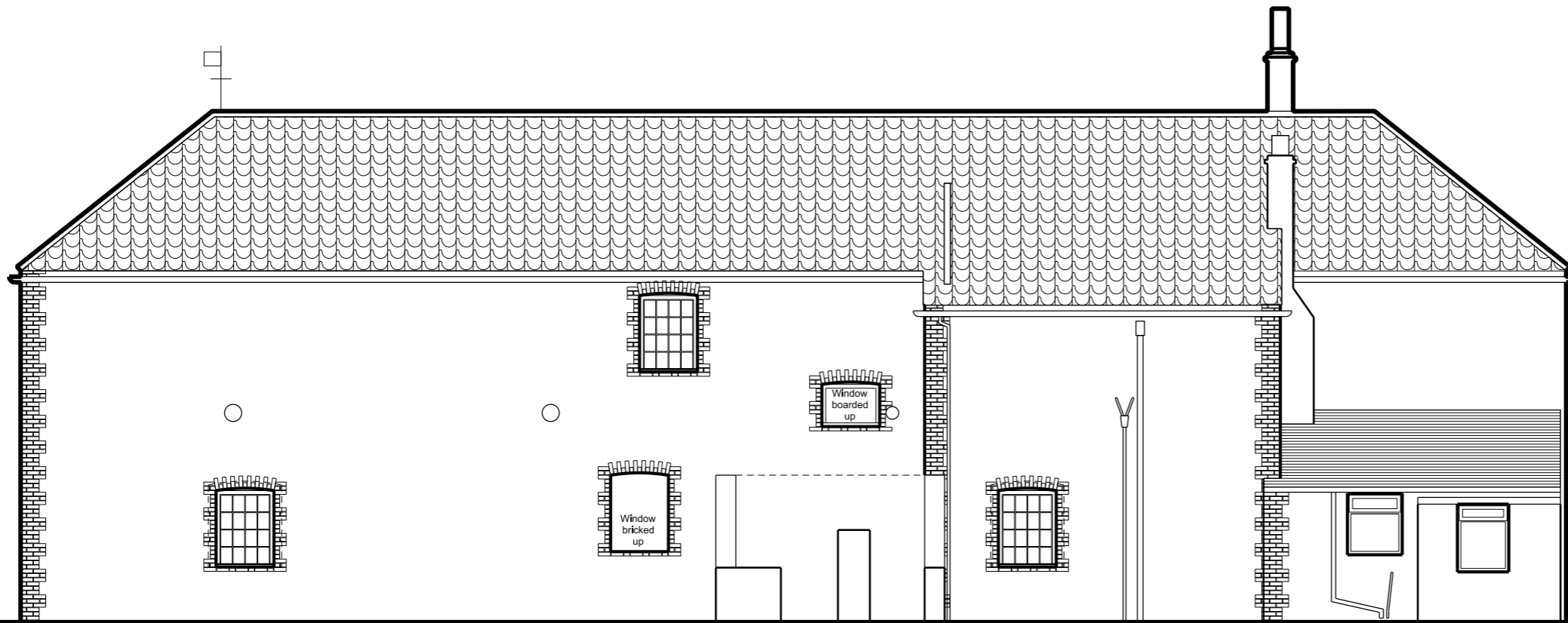
01 EXISTING NORTH ELEVATION