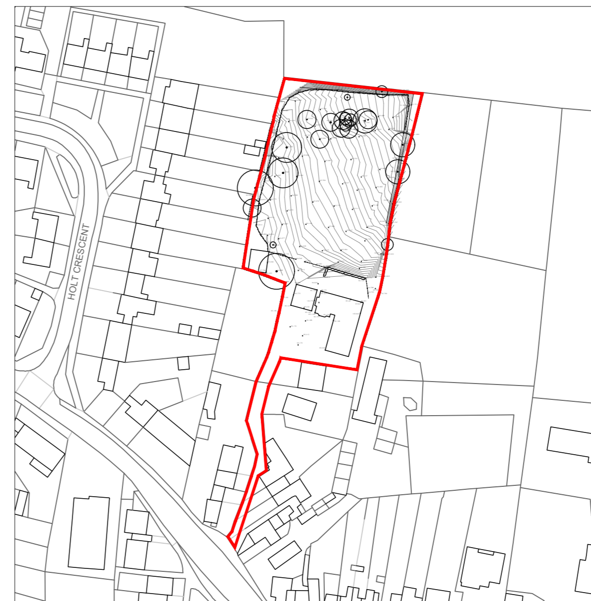
Location Plan Scale 1:1250 @ A2