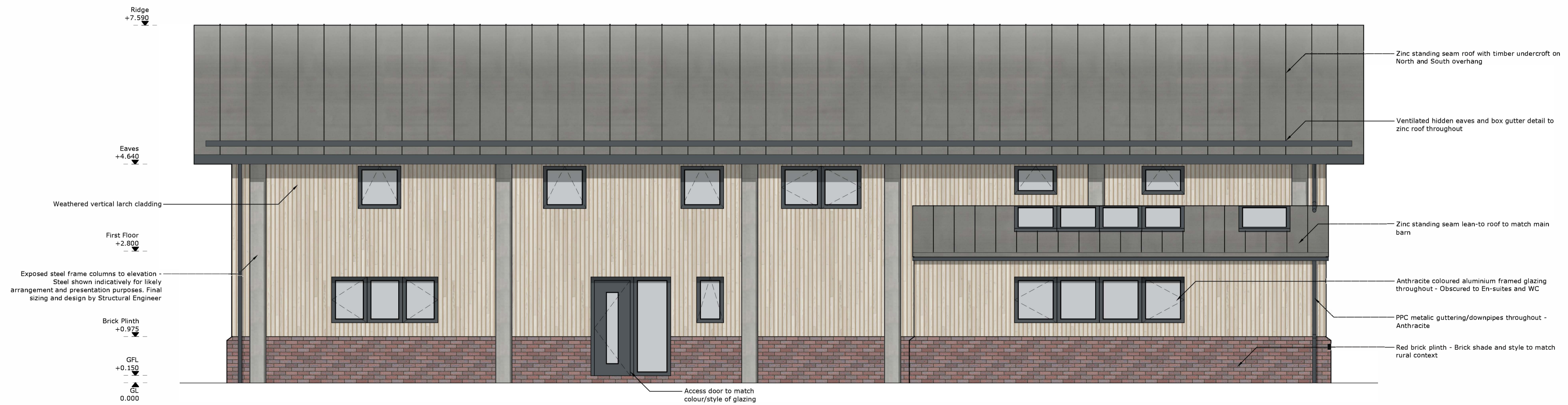
Elevation D - East