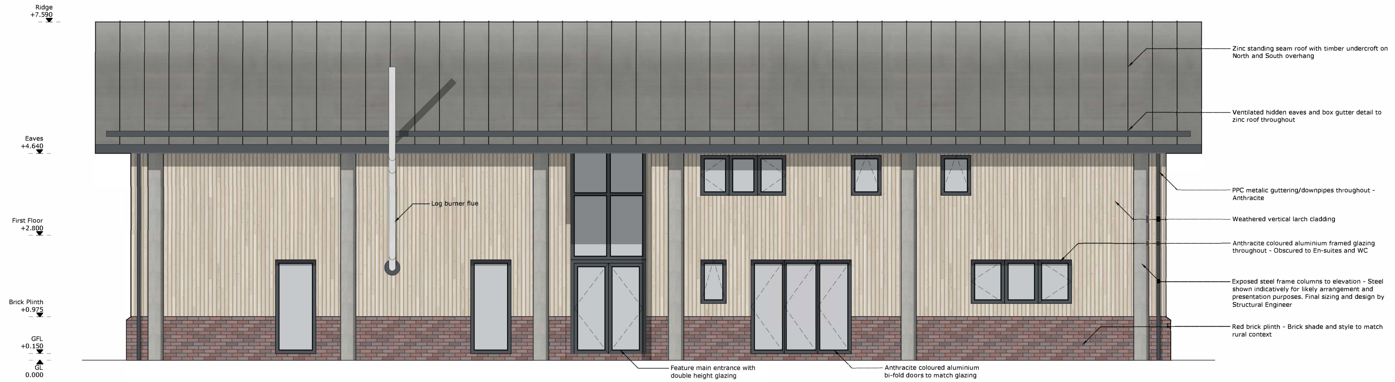
Elevation C - West